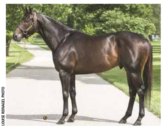
Dark bay or Brown, 2014, Maclean's Music—Quick Temper, by A.P. Indy Standing at Pin Oak Lane, New Freedom, PA. Stud fee: $3,500 LFSN, $3,000 if sending two mares to any Pin Oak Lane stallions, or $2,500 for three or more mares.

Pennsylvania is home to another classic winner as Grade 1 Preakness Stakes-winning Grade 1 sire Cloud Computing has moved from Kentucky to stand his first Pennsylvania season.