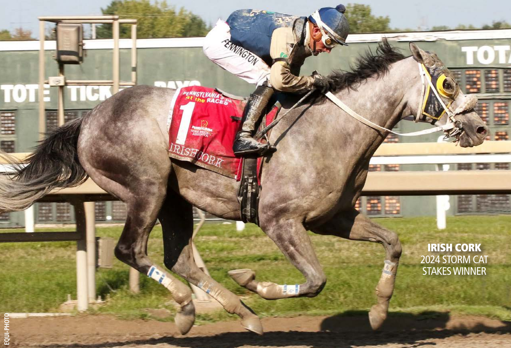
IRISH CORK 2024 STORM CAT STAKES WINNER