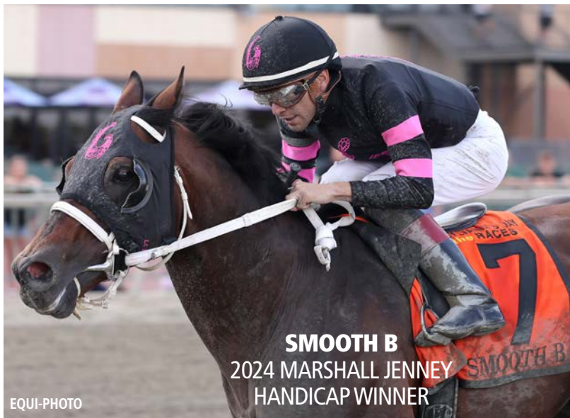
SMOOTH B 2024 MARSHALL JENNEY HANDICAP WINNER

Stakes action kicked off in the seventh race with the $100,000 Marshall Jenney Handicap at 5 furlongs. Moved from the turf to the main track, the field featured five entrants. With three horses vying for favoritism, lost in the