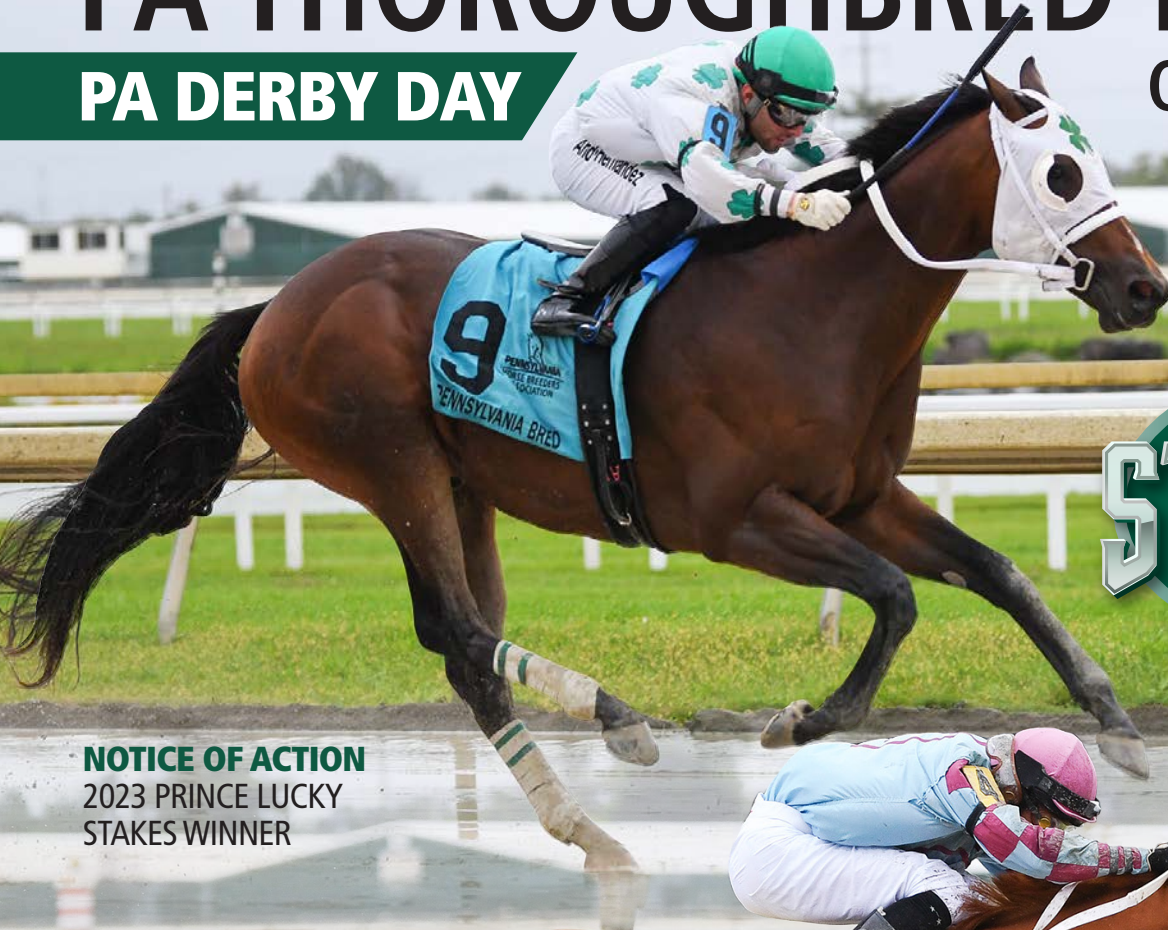
NOTICE OF ACTION 2023 PRINCE LUCKY STAKES WINNER