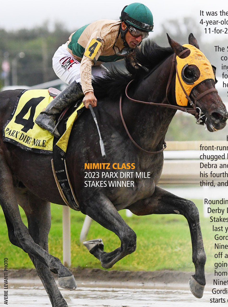
NIMITZ CLASS 2023 PARX DIRT MILE STAKES WINNER