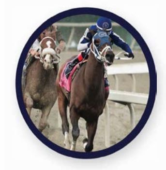
For 6 straight years:

UTCB Stud has ranked in the top 1% in the National Owner Standings!