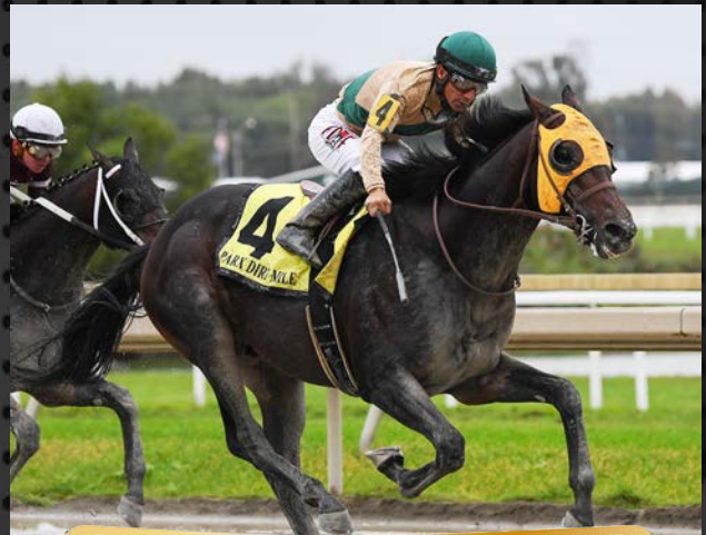
NIMITZ CLASS: Older Horse Breeder: Arrowwood Farm Inc