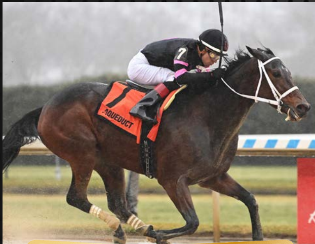
MORNING MATCHA: Older Mare Breeder: Crane Thoroughbred Services