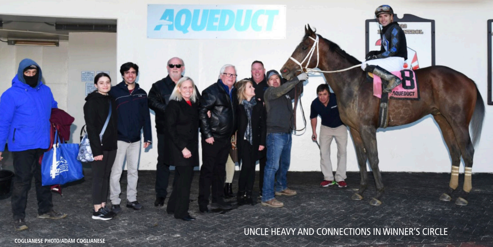
UNCLE HEAVY AND CONNECTIONS IN WINNER'S CIRCLE