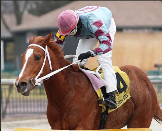
AOIFE'S MAGIC: 2YO filly & HOTY Breeder: Mohns Hill Farm LLC