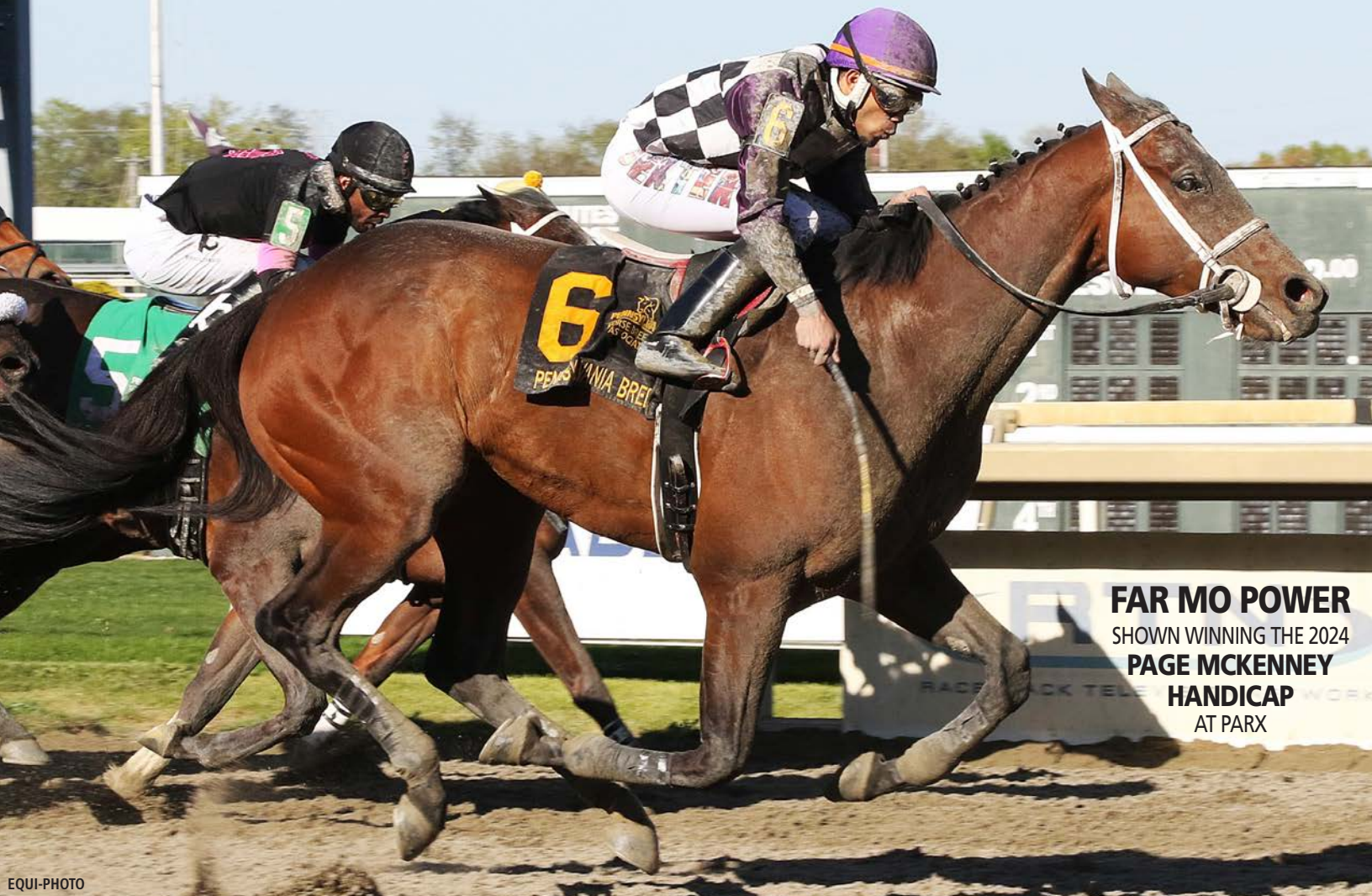
FAR MO POWER SHOWN WINNING THE 2024 PAGE MCKENNEY HANDICAP AT PARX