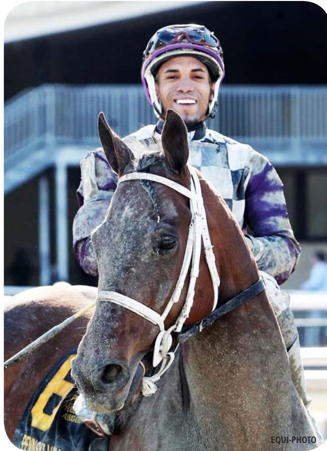
FAR MO POWER LIFETIME EARINGS OF $450,168.00

the most exciting prospect is out of a full sister to J. D. Safari named J D Rain Farrest. It's a no-brainer what the foal nickname theme is this year: the two Uncle Lino colts are named "Peyton" and "Eli". Now they just have to live up to those names, following the path that Far Mo Power has left for them along the way. ■