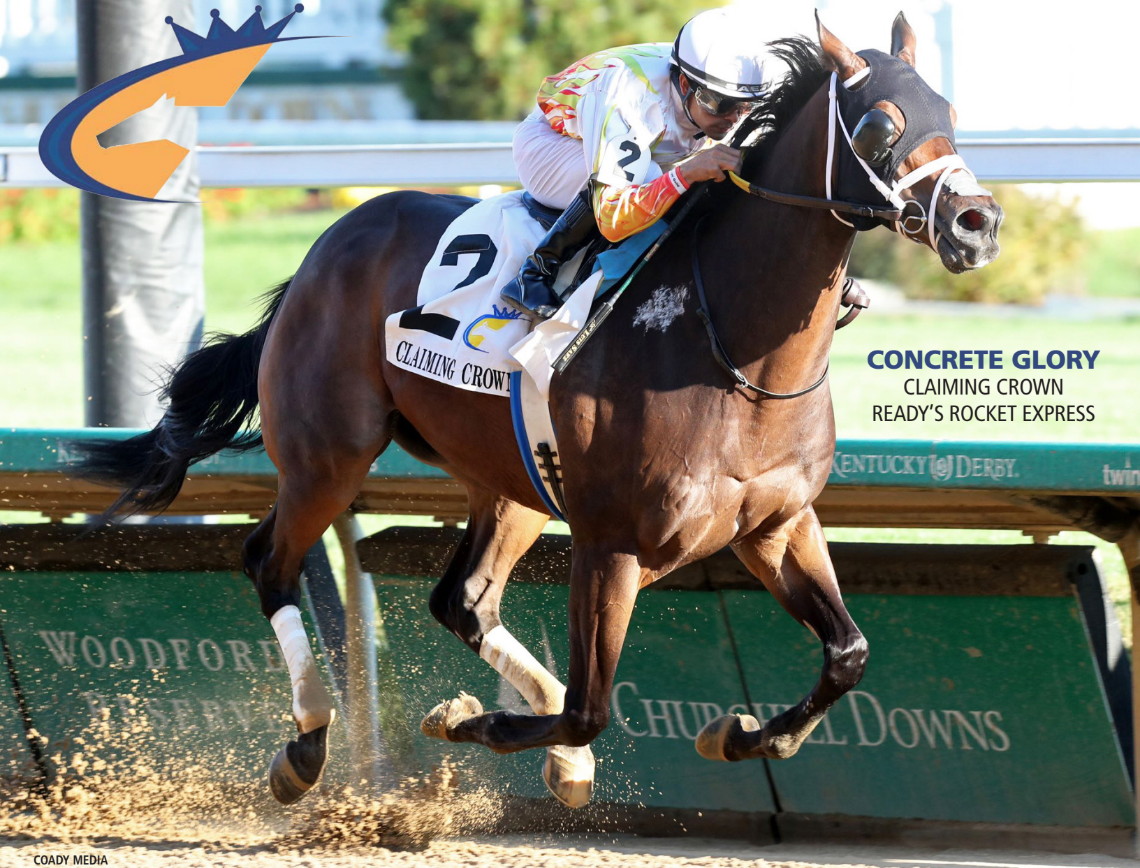
CONCRETE GLORY CLAIMING CROWN READY'S ROCKET EXPRESS