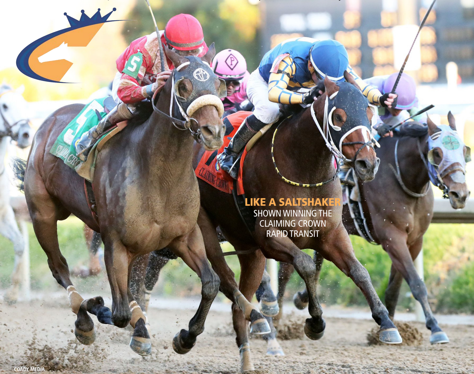
LIKE A SALTSHAKER SHOWN WINNING THE CLAIMING CROWN RAPID TRANSIT