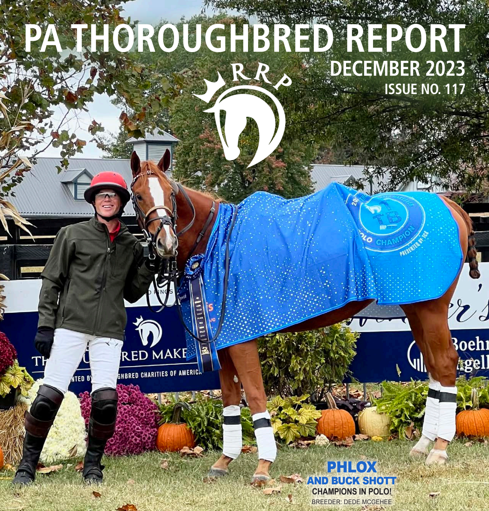
PHLOX AND BUCK SHOTT CHAMPIONS IN POLO! BREEDER: DEDE MCGEEHEE