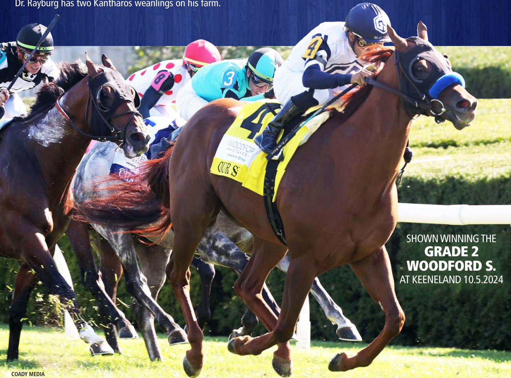
SHOWN WINNING THE GRADE 2 WOODFORD S. AT KEENELAND 10.5.2024