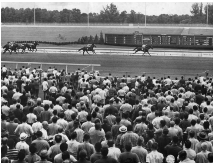
To say that the plant was jam-packed at Liberty Bell Park in its second Thoroughbred meeting in 1970 would be an obvious understatement.

May 31, 1969 —They're off!-at 1:31 p.m. EDT-in the first pari-mutuel Thoroughbred race ever conducted in the commonwealth of Pennsylvania. Liberty Bell Park (an existing harness track in northeast Philadelphia) broke first from the gate, launching a 34-day meeting the day after neighboring Garden State Park closed for the season.