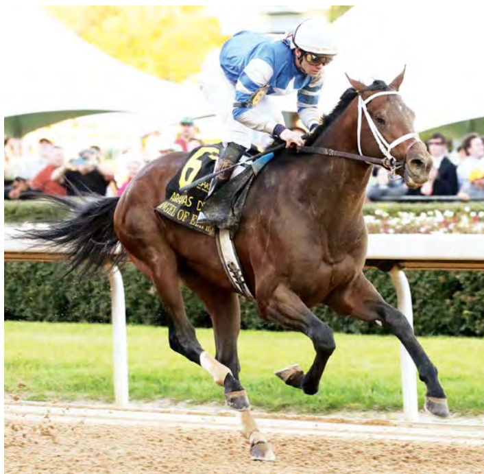
Angel of Empire burst onto the 2023 Triple Crown scene with a victory in the Arkansas Derby-G1.