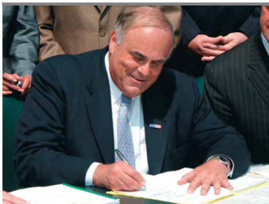
Governor Edward G. Rendell signs the Pennsylvania slots bill into law at Philadelphia Park on July 5.