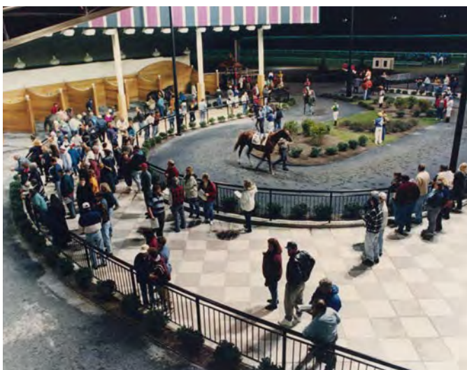
Penn National's paddock, built in 1996, allows fans to get a good view of the horses.