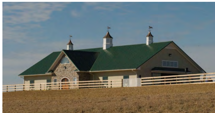
Northview PA opened for operation in 2009 in Peach Bottom.

December, 2009 —Ghost Ridge Farms in Felton announced that the A.P. Indy stallion Jump Start would be moving to the state for the 2010 breeding season. With four crops of racing age, the 10-year-old dark bay had more progeny earnings than any other stallion standing in Pennsylvania. Jump Start took charge of the leading sires list and led the region from 2014 through 2021 when including his international earnings. He was also the leading sire of PA stallion awards for seven years, from 2015 through 2021. Moved to Northview PA in 2012, he died at age 20 in May 2019.