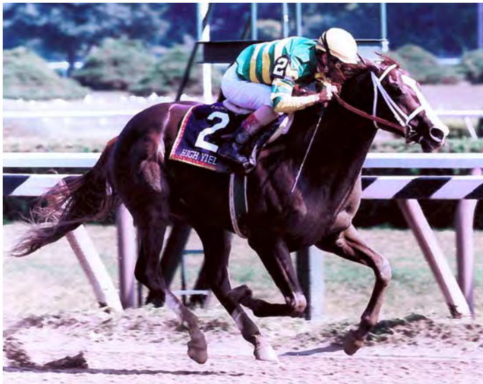
A million-dollar yearling, High Yield was a Grade 1 winner at 2 and 3 and became a millionaire.