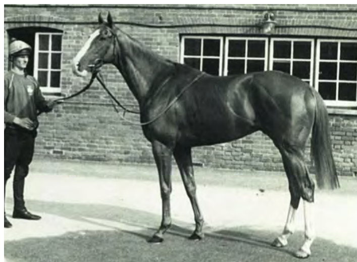
Two-time champion miler in England, Selkirk became a major sire while standing his entire career at Lanwades Stud in Newmarket.

the Prix Coronation at Saint-Cloud. She recorded four stakes wins all told in France, two in Group 3 company. Her eight stakes placings were all group races, six Group 1s, while racing in England, France, Japan (twice in the Mile Championship) and Hong Kong (Hong Kong Mile). She was voted Pennsylvania-bred champion turf horse three years in a row and champion older female twice. In 22 career starts she won eight and hit the board in nine others, to amass $2,032,282, the most for any PA-Bred mare in history.