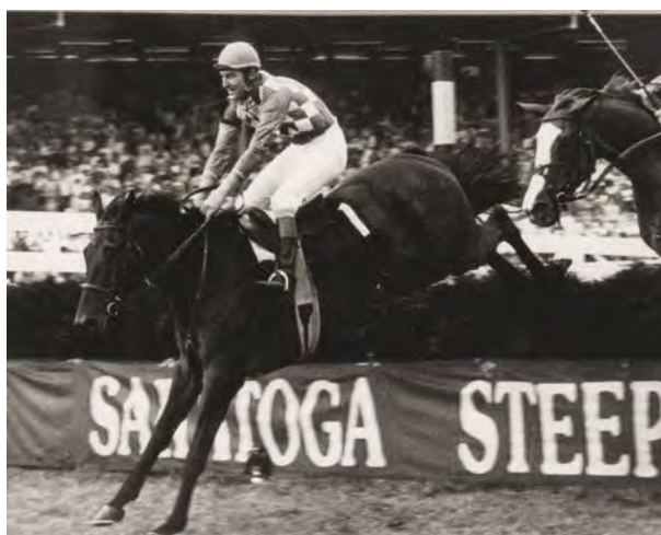
Flatterer was the nation’s steeplechase champion for an unprecedented four seasons, from 1983 to 1986. The PA-bred was inducted into the Racing Hall of Fame in 1994.