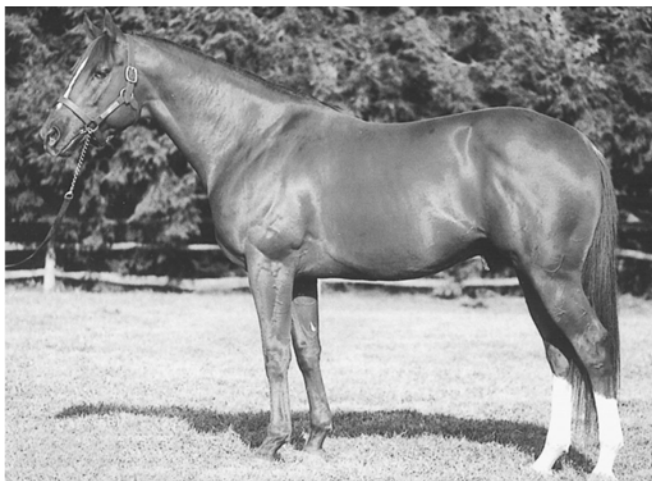
Named Pennsylvania's stallion of the year for seven consecutive seasons was Nepal. The son of Raja Baba-Dumtadumtadum, by *Grey Dawn II stood at Upland Spring Farm in Unionville.