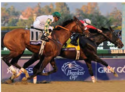
Pennsylvania stallions Wiseman's Ferry and E Dubai sire stars of the 2012 Breeders' Cup: Wise Dan takes the Mile and Fort Larned the Classic.

November, 2012 —For the second time in less than five years, two Pennsylvania stallions were represented by winners of Breeders' Cup races in the same year. Wiseman's Ferry's son Wise Dan captured the Breeders' Cup Mile-G1 on his way to being named Eclipse Award-winning Horse of the Year, champion grass horse and champion older horse, which he'd repeat in 2013. The Classic-G1 went to Fort Larned, a son of E Dubai.