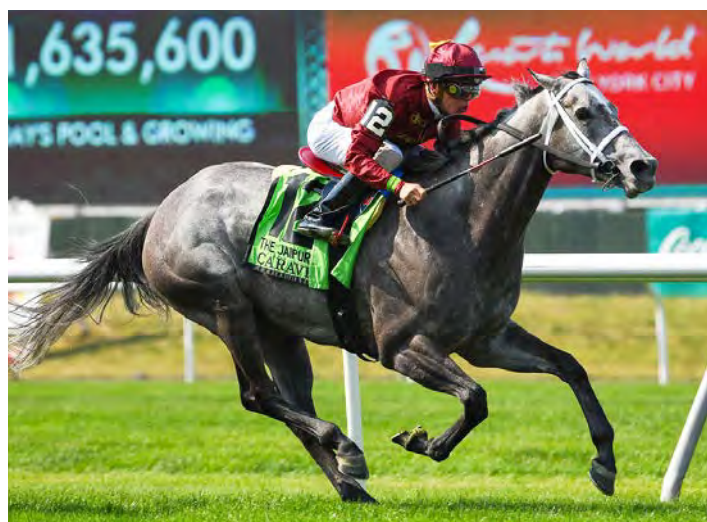
Breeders' Cup winner Caravel is a multiple Grade 1 winner against males.