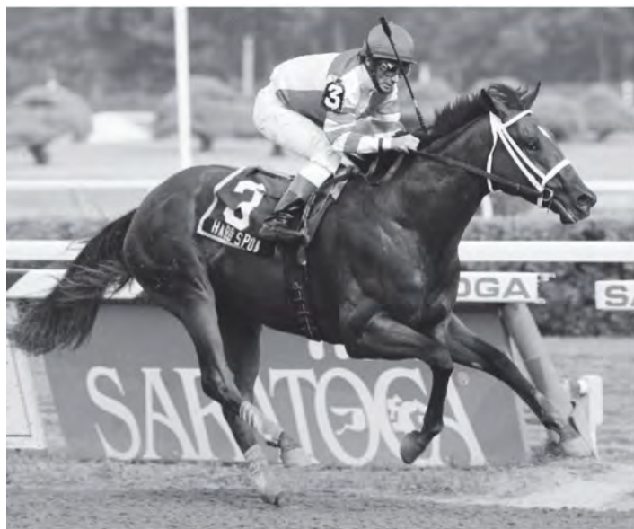
Classic-placed Hard Spun became a Grade 1 winner in Saratoga's King's Bishop Stakes.