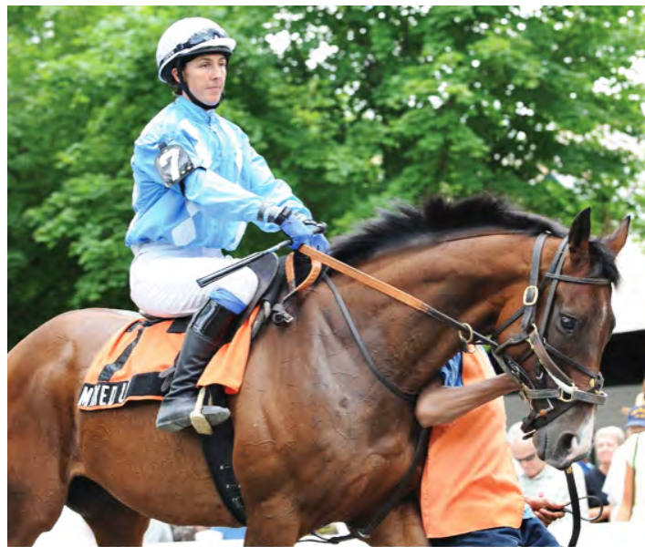
Mixed Up was a stakes winner on the flat and an Eclipse Award winner over jumps.