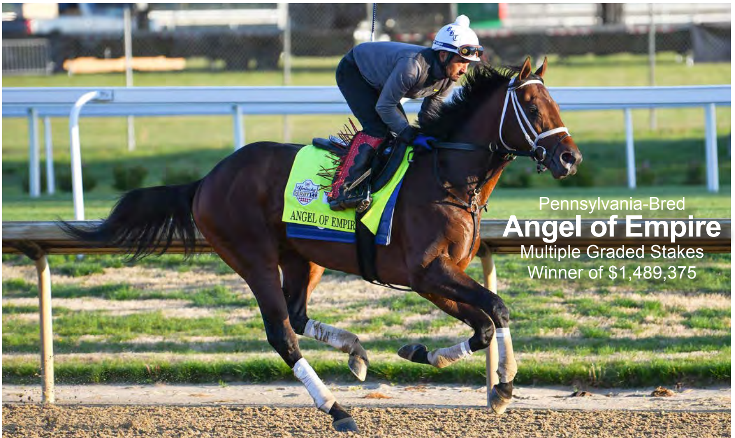
Pennsylvania-Bred Angel of Empire Multiple Graded Stakes Winner of $1,489,375