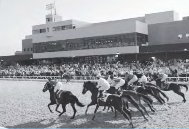
Presque Isle Downs in Erie got underway on September 1, 2007, with an opening day crowd of approximately 16,000.