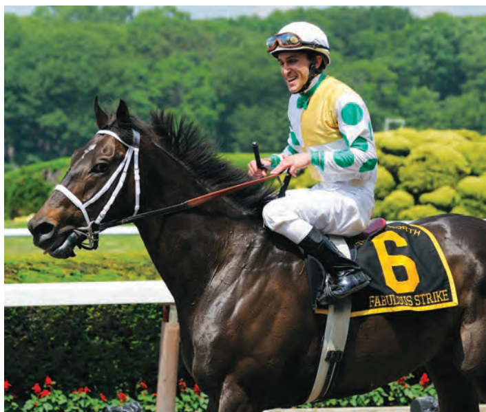
Fabulous Strike was one of the nation's best sprinters from 2006 through 2009.

the Grade 2 Somerset Medical Center Hurdle at the Meadowlands as a 4-year-old in 2007. At ages 7 and 8, he added back-to-back victories in the Grade 2 A.P. Smithwick Memorial Steeplechase at Saratoga. During his championship season as a 10-year-old in 2013, Divine Fortune won the Grade 1 Grand National Hurdle at Far Hills and placed twice in Grade 1 races. At age 11, racing exclusively in Grade 1s, he added the Calvin Coolidge Iroquois Hurdle and Colonial Cup and was runner-up in his Grand National title defense. With 12 wins, nine seconds, and three thirds in 47 starts, Divine Fortune earned $829,795.