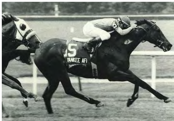
Yankee Affair, winner of 15 stakes (three Grade 1s), ranked as Pennsylvania's all-time leading money-earner throughout much of the 1990s. The gelded son of PA stallion Northern Fling amassed $2,282,156 with 22 victories in 55 starts.