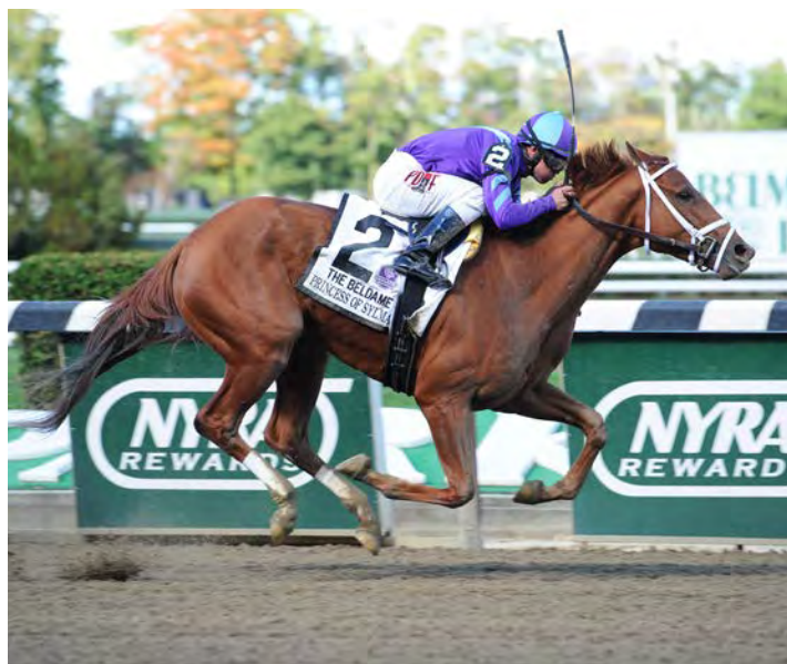
Princess of Sylmar was the second PA-bred to win the Kentucky Oaks-G1 in three years.