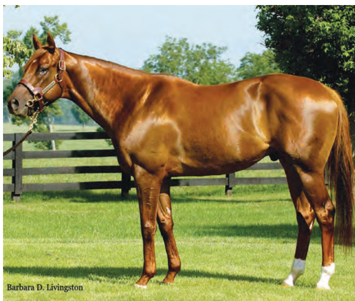
Smarty Jones returned to Pennsylvania to stand at stud and now resides at Equistar Training & Breeding in Annville.