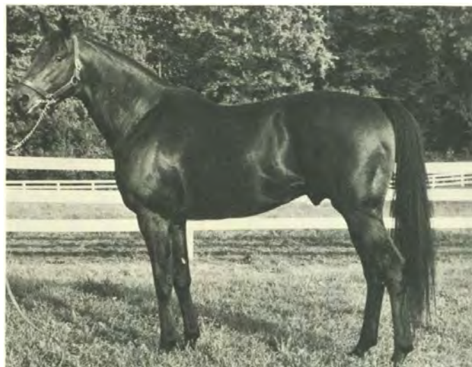
The first Pennsylvania Futurity was split and won by Triple Reverse and Pay the Toll (pictured), who later stood at stud in the region.