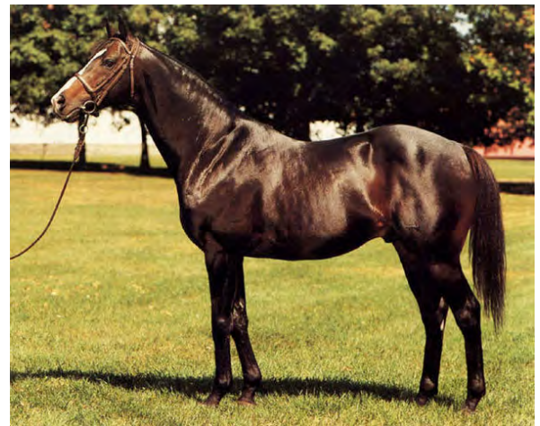
One of the world's most influential stallions, Lyphard lived to be 36.