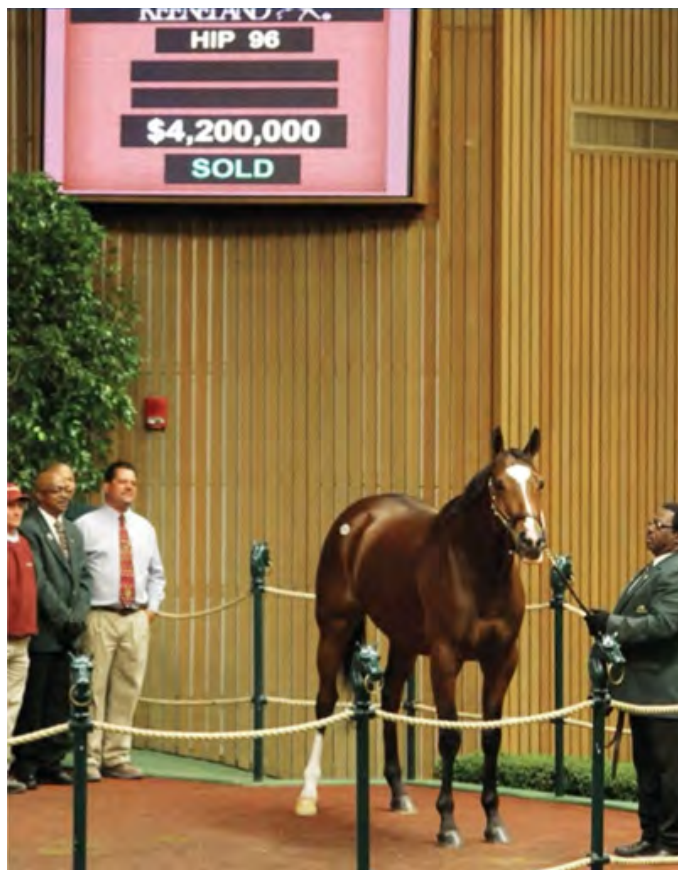
At $4.2 million, Plum Pretty is the highest-priced Pennsylvania-bred sold at public auction.

Brushwood Stable was the breeder of eight yearlings to sell for seven figures, the first High Yield in 1998 for $1.05 million. Four years later, full-brother Turbo Storm sold for $1 million. Both were by Storm Cat out of Scoop the Gold (by Forty Niner). Two other Brushwood mares had multiple seven-figure yearlings. Homebred Balistroika produced two million-dollar sales yearlings—Empress Olga (2004, by Kingmambo) for $1.5 million and Perfect-performance (2002, Rahy) for $1.1 million. Balistroika was also the dam of champion Russian Rhythm (2000,