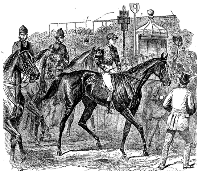
Pennsylvania’s stature as a Thoroughbred breeding center was established more than a century ago by Iroquois, who in 1881 became the first American horse ever to win the English Derby.