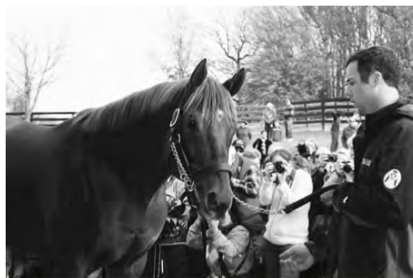
Smarty Jones remains as big a draw as ever when he returns to the state in 2010 to stand the upcoming breeding season.