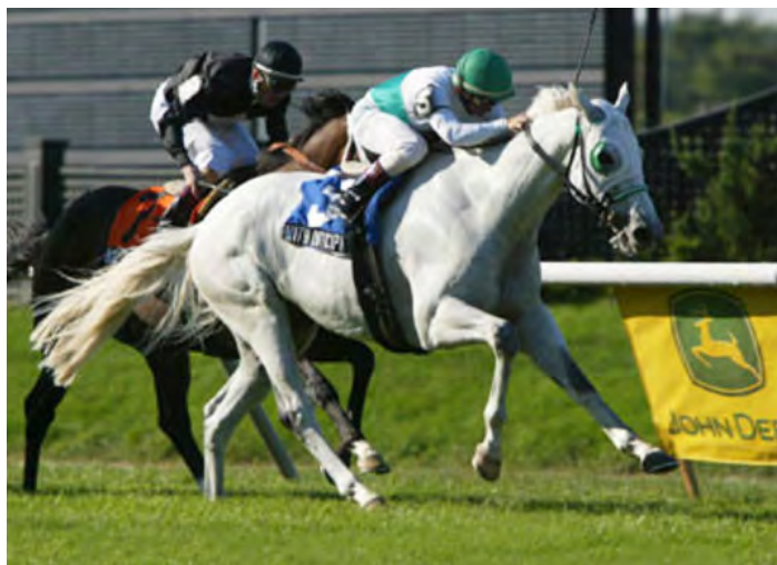
Eye-catching With Anticipation found his home on the turf, winning five Grade 1s during his career.