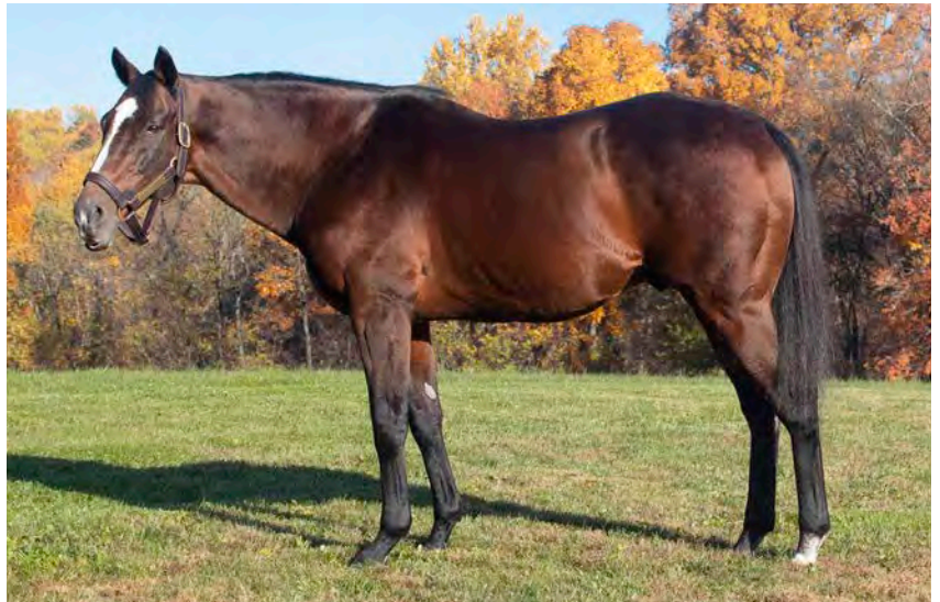
Weigelia has sired an arsenal of talented PA-bred runners to become the state's leading sire of stallion awards in 2022.