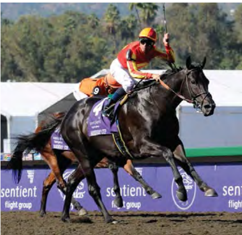
Real Quiet's son Midnight Lute, the first two-time winner of the Breeders' Sprint-G1, won in stakes record time of 1:07.08 at Santa Anita in 2008.

February 12, 2008 —Hollywood Casino at Penn National Race Course opened to rave reviews. Described as a "multi-purpose gaming center with style and glamour and every imaginable amenity" it drew comments that included it was "unlike anything seen thus far when it comes to the marriage of race tracks and slot machines known as racinos."