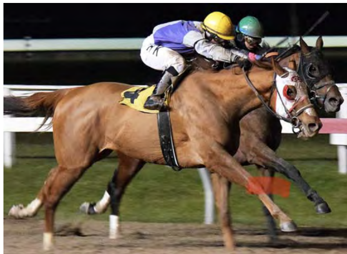
Page McKenney was a fan favorite as the consistent gelding won 22 times in 58 starts around the region.