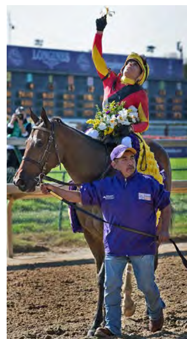
For the second time in three years, a PA-bred filly wins the Breeders' Cup Filly and Mare Sprint-G1 and takes the Eclipse Award, this time Shamrock Rose.

In the second half of 2018, Shamrock Rose strung together a four-race win streak that ended with her becoming the second PA-bred to win a Breeders' Cup race in three years. Bred by Best A Luck Farm LLC and trained