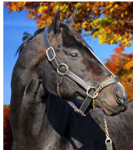
Jump Start moves to Pennsylvania and becomes the most dominant sire in the region for the next decade.

July, 2010 —The Pennsylvania HBPA, representing owners and trainers at Penn National and Presque Isle Downs, announced plans for a Thoroughbred retraining program to be run in conjunction with the successful New Vocations. New Start was created in 2013 with a mission to work with foster farms to find qualified homes for horses that have been retired from racing at Penn National.