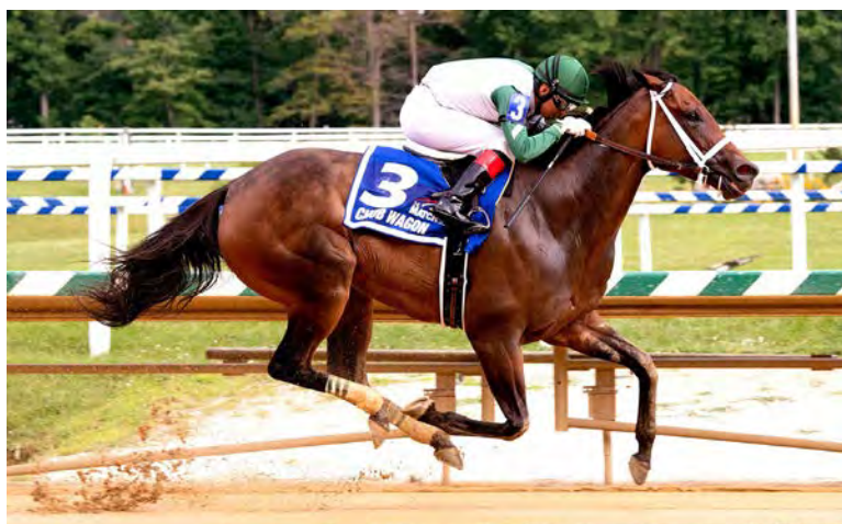
Chub Wagon was a win machine as she ran her win streak to eight on her way to being named 2021 PA-Bred Horse of the Year.

March, 2021 —The PHBA announced its endorsement of the John Stringer Rainey Safeguard American Food Exports (SAFE) Act, legislation that would permanently end the slaughter of American horses for human consumption in the United States and abroad.