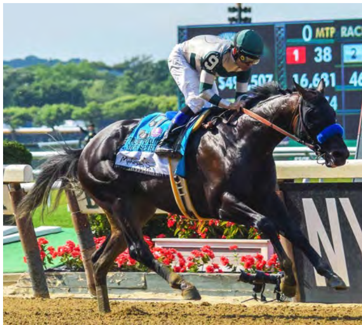
Belmont's Met Mile-G1 was won by Mor Spirit by daylight in 1:33.71.