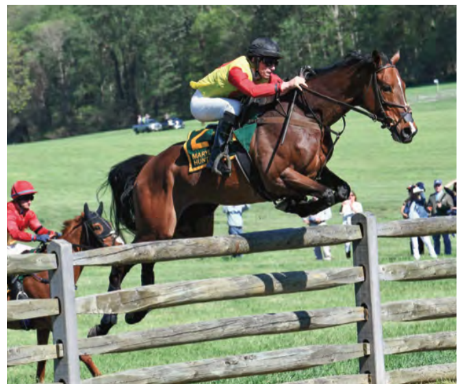
Senior Senator added his name to a select list of horses to win the Maryland Hunt Cup three times.