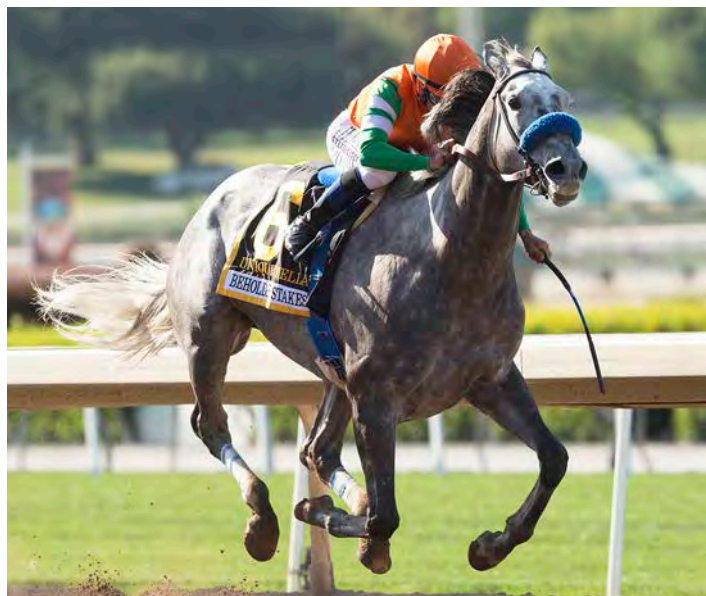
Two-time champion Unique Bella won the 2017 Eclipse Award for female sprinter and the 2018 Eclipse Award for champion older dirt mare.