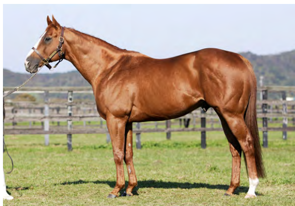
Japanese-based Nobo Jack held the title of richest PA-bred in history when his earnings surpass $3.8 million. The record was short-lived when Smarty Jones surpassed it the next year.