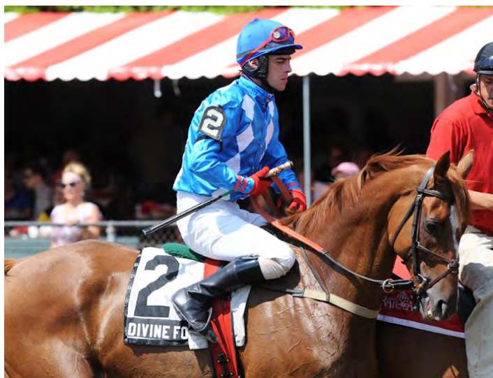
Divine Fortune earned an Eclipse Award as champion steeplechaser in 2013.

the Grade 2 Somerset Medical Center Hurdle at the Meadowlands as a 4-year-old in 2007. At ages 7 and 8, he added back-to-back victories in the Grade 2 A.P. Smithwick Memorial Steeplechase at Saratoga. During his championship season as a 10-year-old in 2013, Divine Fortune won the Grade 1 Grand National Hurdle at Far Hills and placed twice in Grade 1 races. At age 11, racing exclusively in Grade 1s, he added the Calvin Coolidge Iroquois Hurdle and Colonial Cup and was runner-up in his Grand National title defense. With 12 wins, nine seconds, and three thirds in 47 starts, Divine Fortune earned $829,795.