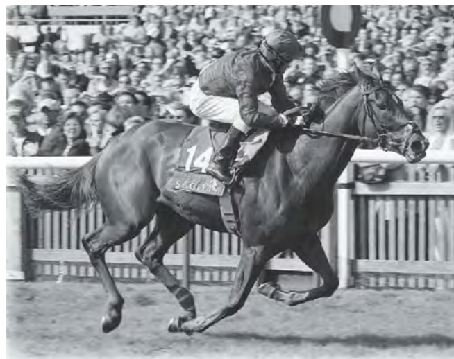
Russian Rhythm became a classic winner in England's One Thousand Guineas-G1 at Newmarket.