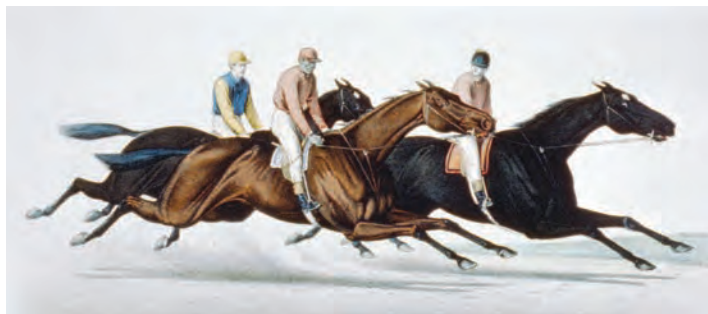
The iconic depiction of the Great Sweepstakes at Pimlico shows Parole in front.