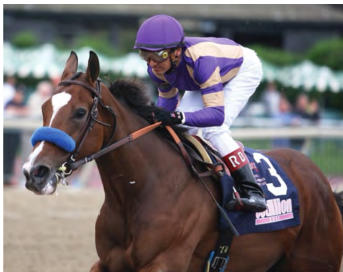
Winner of the Kentucky Oaks-G1 and a 3-year-old Eclipse Award finalist, Plum Pretty also was a Grade 1 winner at 4.

2008, by Medaglia d'Oro—Liszy, by A.P. Indy. Bred by Silent Indy Stables LLC and DDS Stables; owned by Peachtree Stable; trained by Bob Baffert.