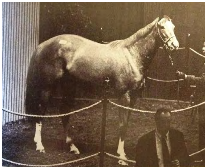
Treizieme was a world-record priced weanling and, after becoming a Group 1 winner at 2, was a $1.75 million broodmare prospect.