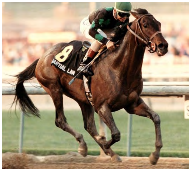
Martial Law win the $1,000,000 Santa Anita Handicap and pays $103.60.