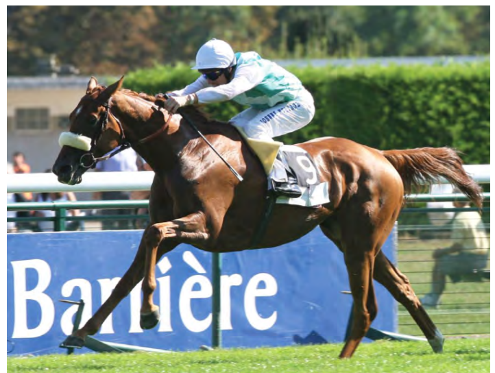
Mrs. Lindsay won the Group 1 Prix Vermeille in France, just as her fourth dam Mrs. Penny did 27 years earlier.