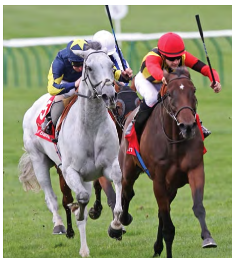
Sahpresa (right) made headlines in England when winning three consecutive runnings of the Group 1 Sun Chariot Stakes at Newmarket.