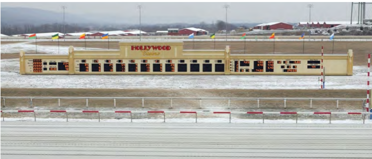
Hollywood Casino at Penn National Race Course was described as the "marriage of race tracks and slot machines".

October 27, 2007 —Real Quiet's son Midnight Lute dominates the Breeders' Cup Sprint-G1 at Monmouth Park.