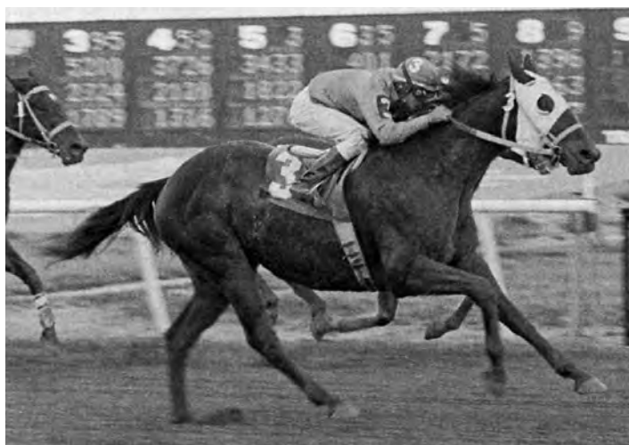
The durable 22-time stakes winner Curribot won 37 times in 139 starts.