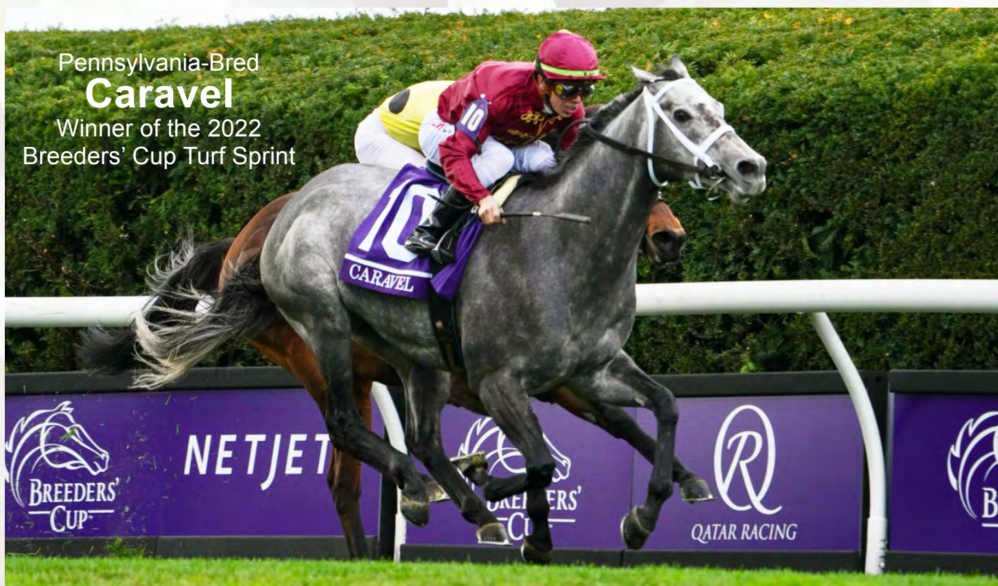
Pennsylvania-Bred Caravel Winner of the 2022 Breeders' Cup Turf Sprint