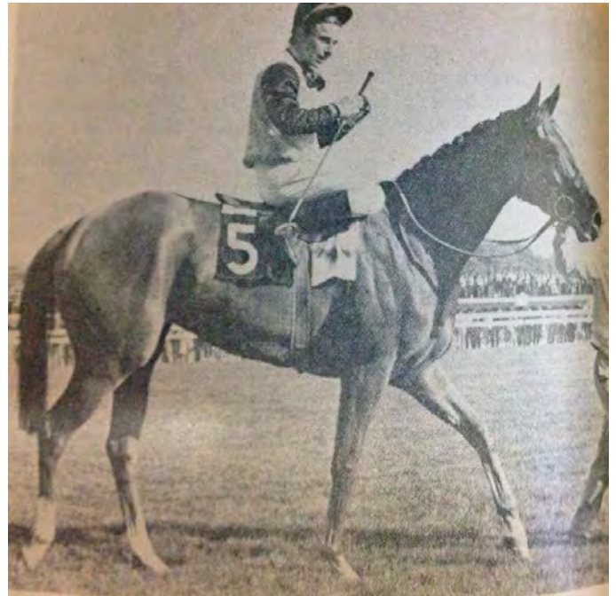
Pistol Packer was a champion two seasons and a classic winner in France.

August 30, 1972 —Penn National opens its doors as the first Pennsylvania track built exclusively for Thoroughbred racing. Scheduled to run 100 nights (through December 30), the