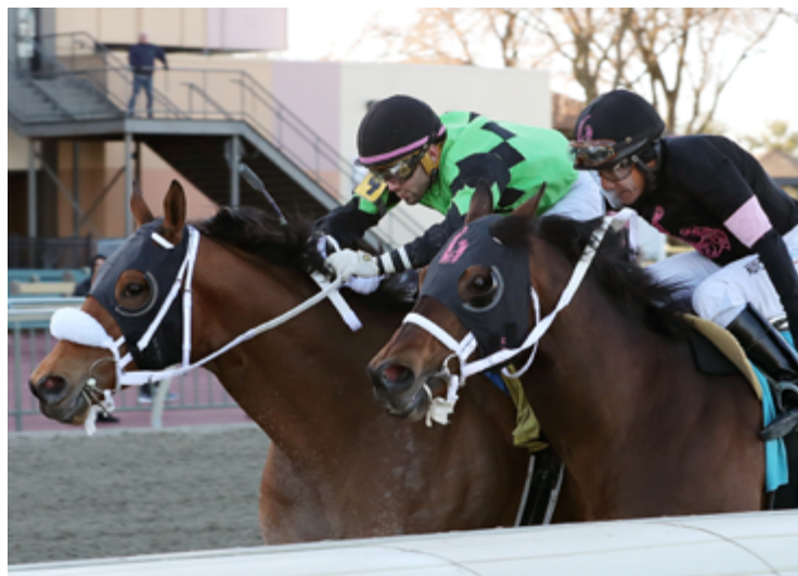
TWISTED RIDE - Fishtown Stakes