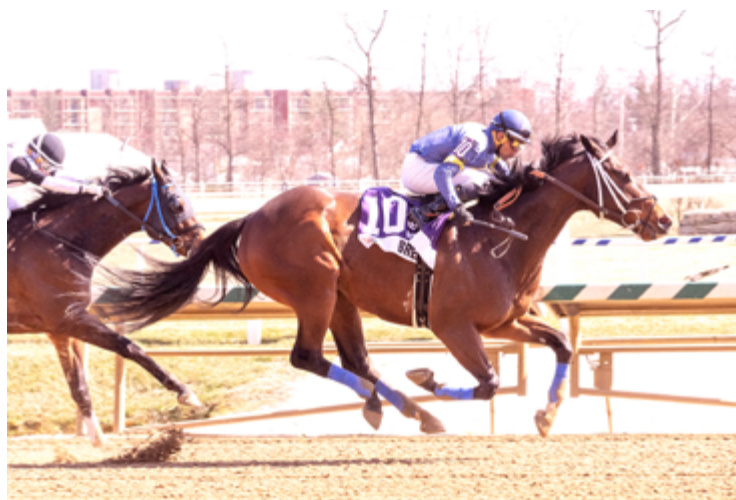
BREEZY GUST - Not For Love Stakes

For his new connections, he won three straight and tackled the 2021 Page McKenney Handicap, finishing third. He then made his first two starts outside of Pennsylvania and failed to finish either – the Grade 3 Maryland Sprint Series Stakes on Preakness Day at Pimlico, and an allowance that June at Delaware Park. It was nearly six months before he returned.