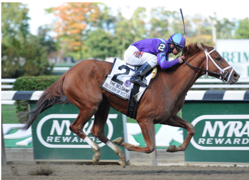
Princess of Sylmar - Beldame

With Hall of Fame rider Mike Smith getting the call, Princess of Sylmar broke from post 6. Right at the start, Beholder, in post 3, broke outward, while Rose to Gold, in post 9, broke inward, squeezing all five horses in between them. Stuck in the very middle, Princess of Sylmar and Mike Smith were sandwiched so badly that Smith thought he wasn't going to stay on the filly. Miraculously, the pair recovered but dropped back to ninth, nearly 11 lengths off the pace-setting Midnight Lucky.