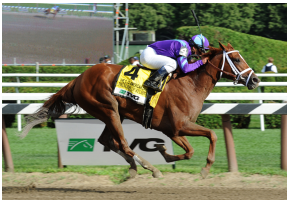
Princess of Sylmar - Coaching Club American Oaks