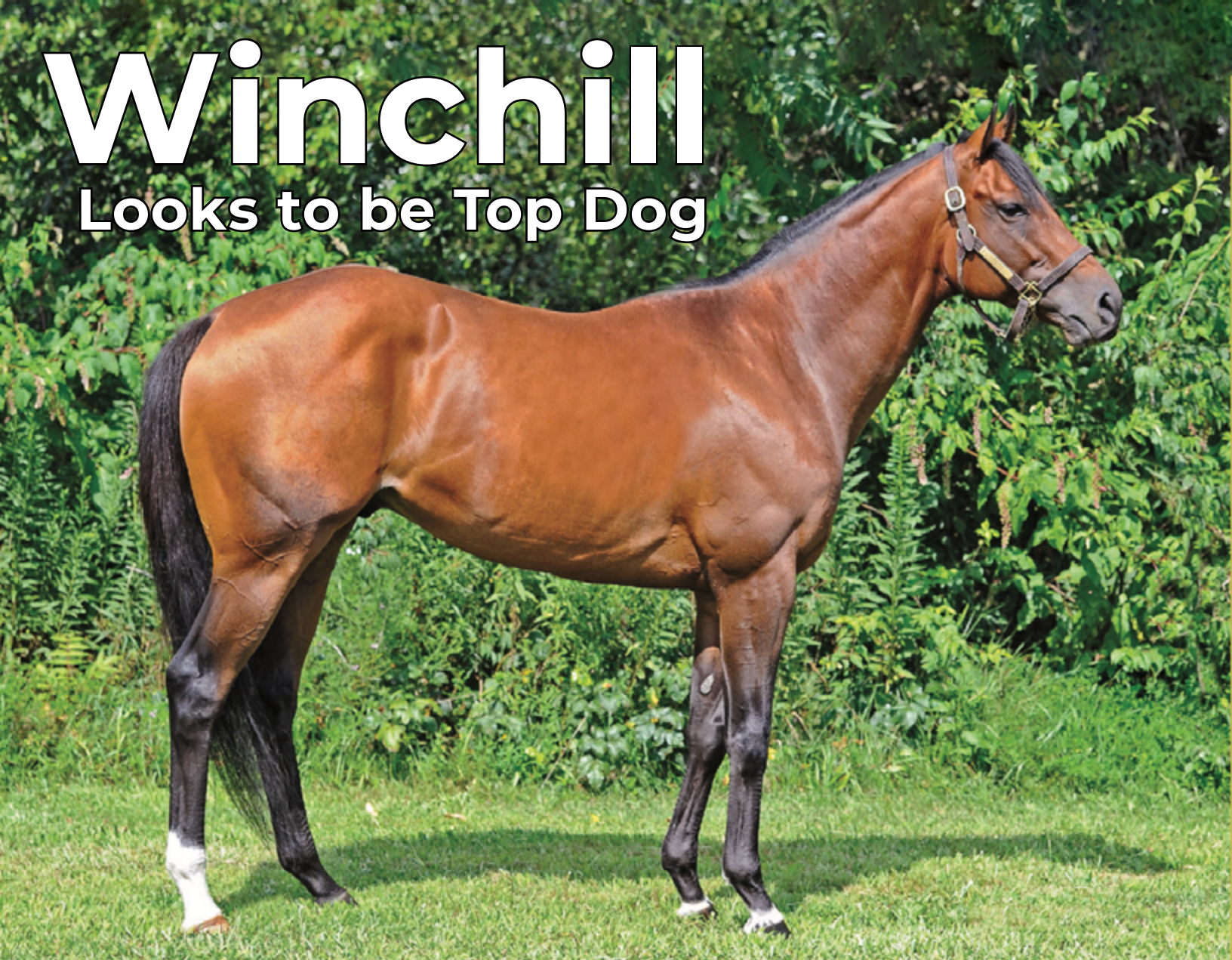
Winchill.