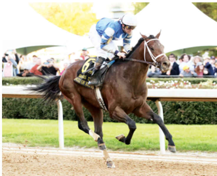
ANGEL OF EMPIRE - Arkansas Derby.