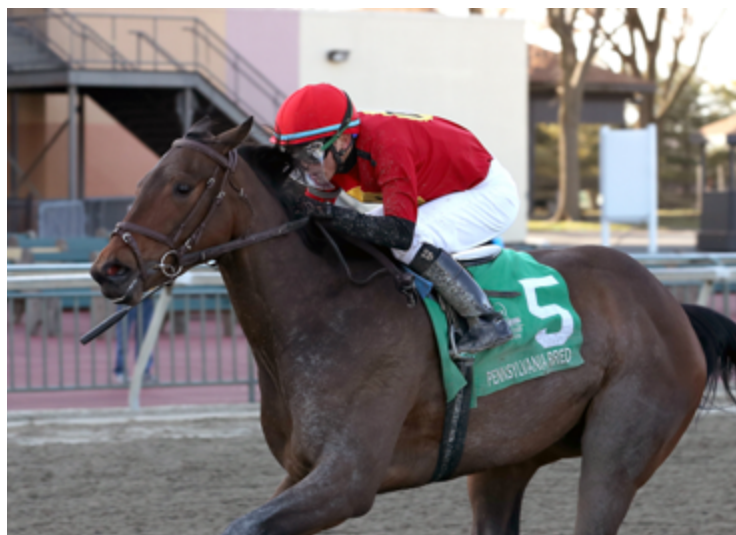
TAPPIN JOSIE - Society Hill Stakes