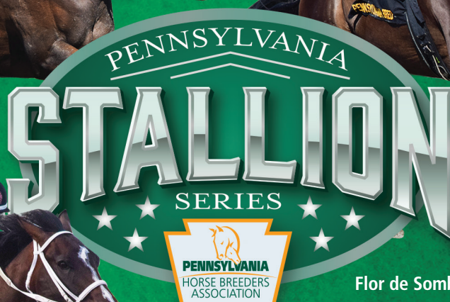
Flor de Sombra