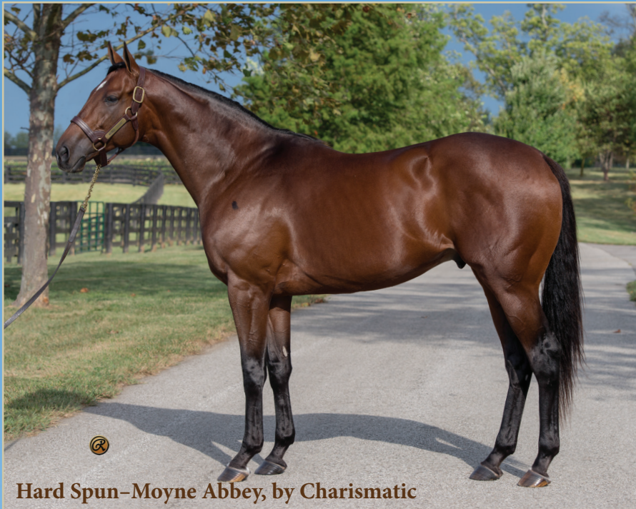
Hard Spun—Moyne Abbey, by Charismatic