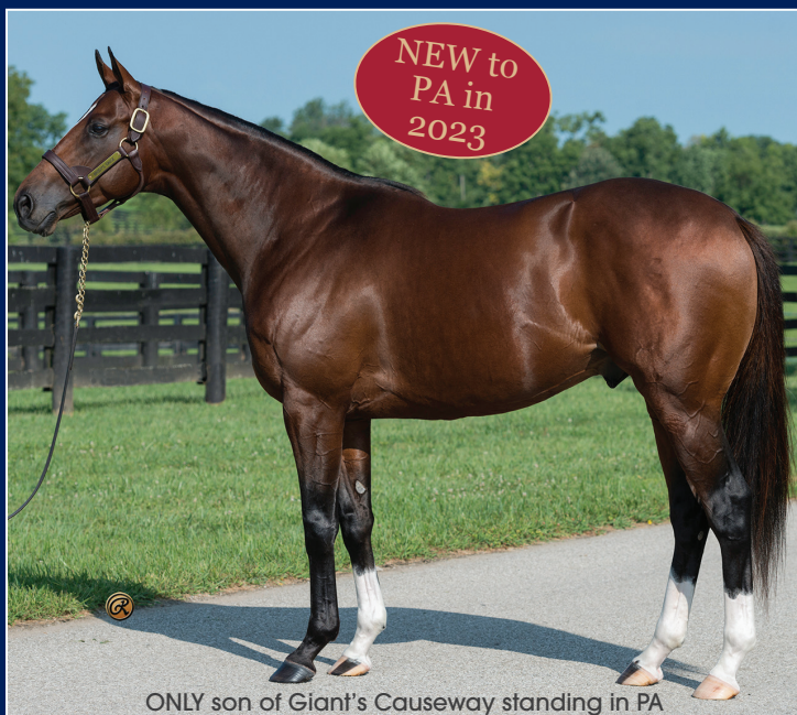
ONLY son of Giant's Causeway standing in PA