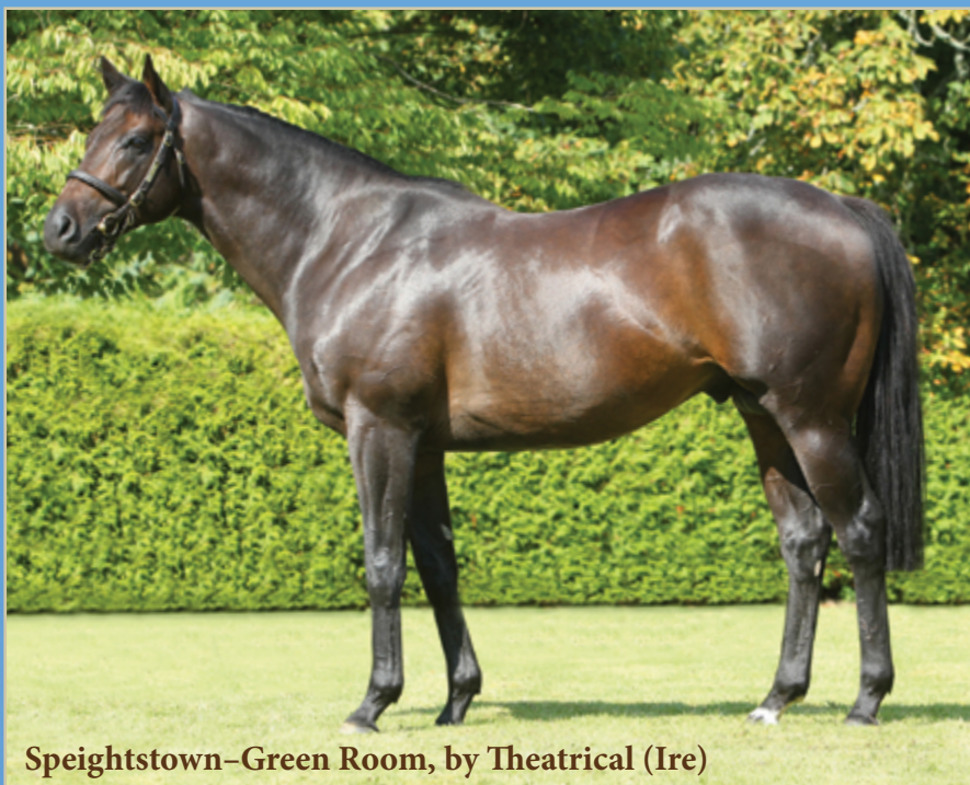
Speightstown-Green Room, by Theatrical (Ire)