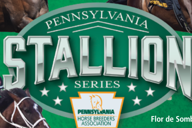
Flor de Sombra