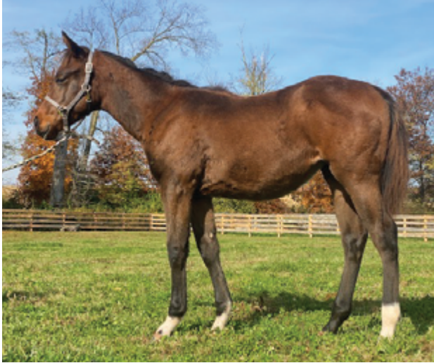
5/4/22 Filly out of Mathildestrevenue, by Blame