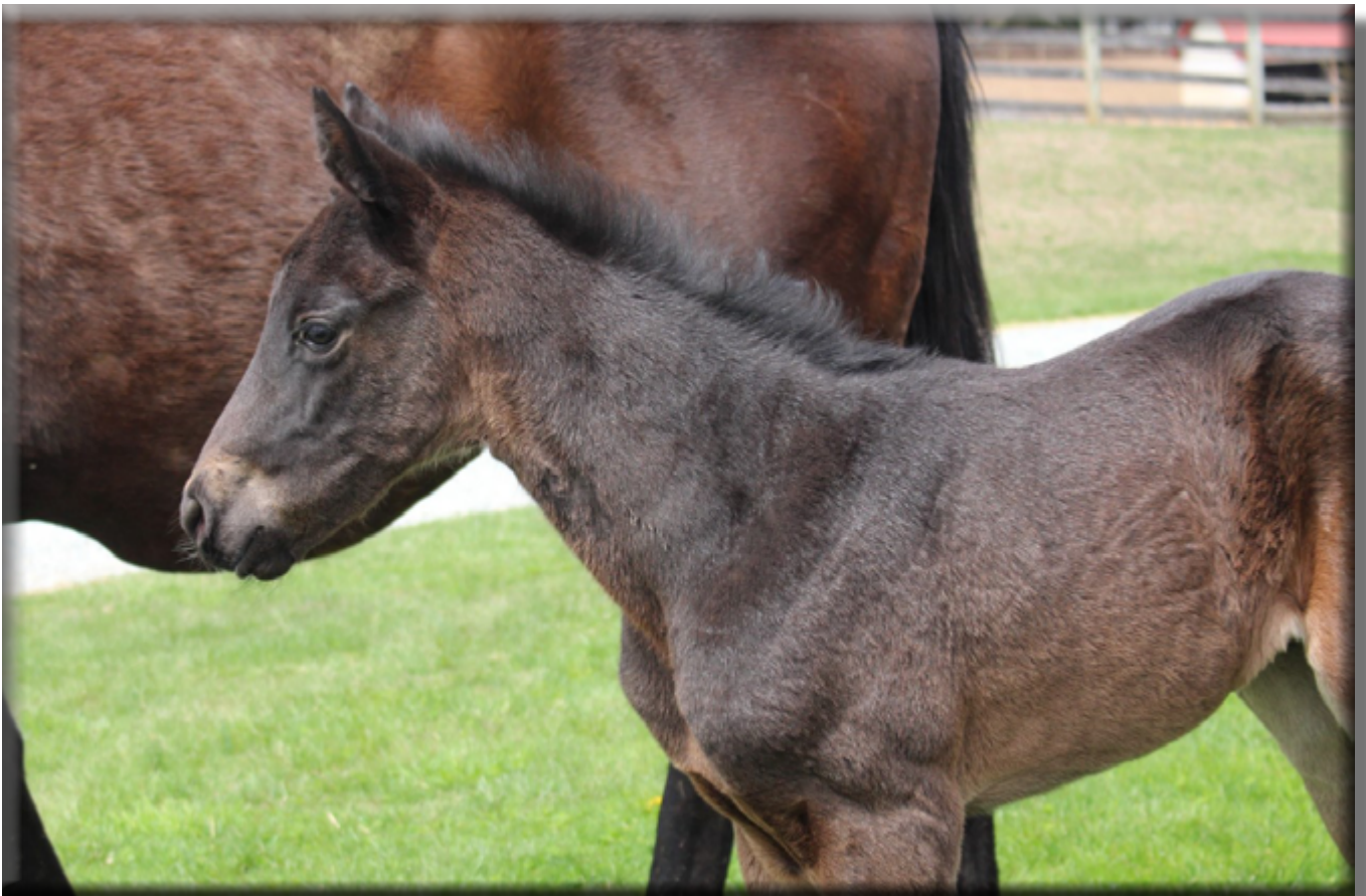
‘22 foal by Uptowncharlybrown, photo courtesy of Joerg Hoffman