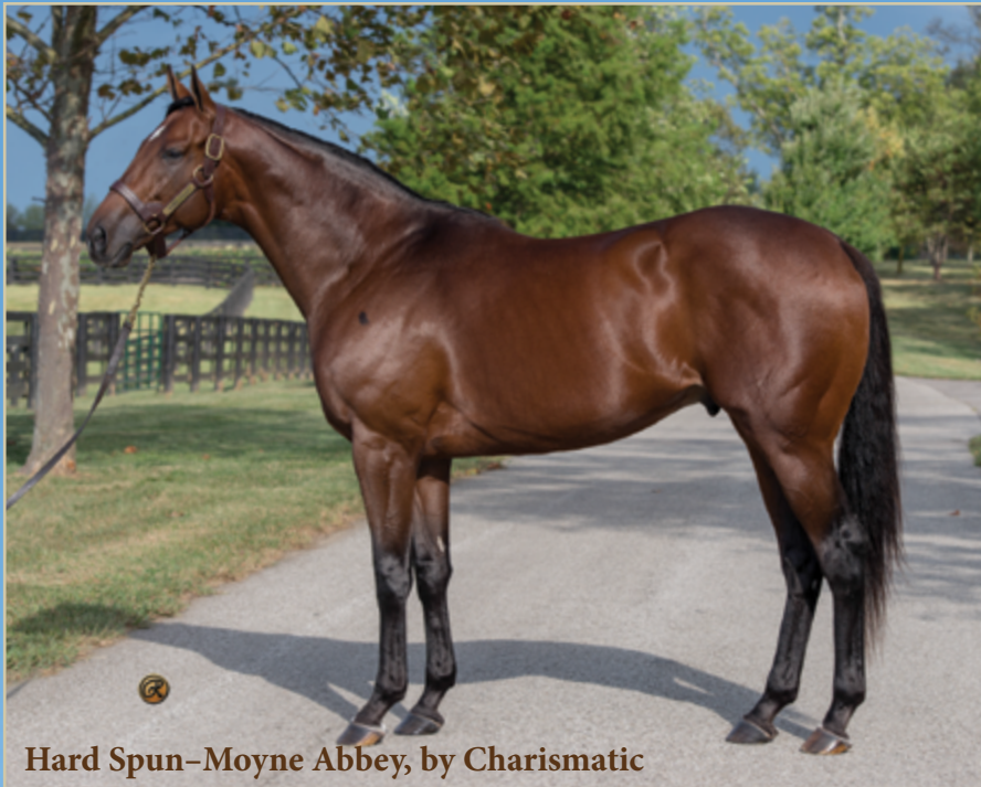
Hard Spun—Moyne Abbey, by Charismatic