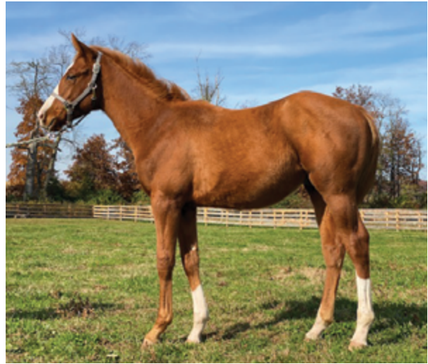
5/13/22 Colt out of Fill Up Cohen, by Ecclesiastic

Won his second start (of 30 lifetime) in a Saratoga maiden special weight and went on to win an additional 8 races—all stakes—including the Grade 2 Kelso H with a 103 Beyer score (below), and 10 stakes placings.