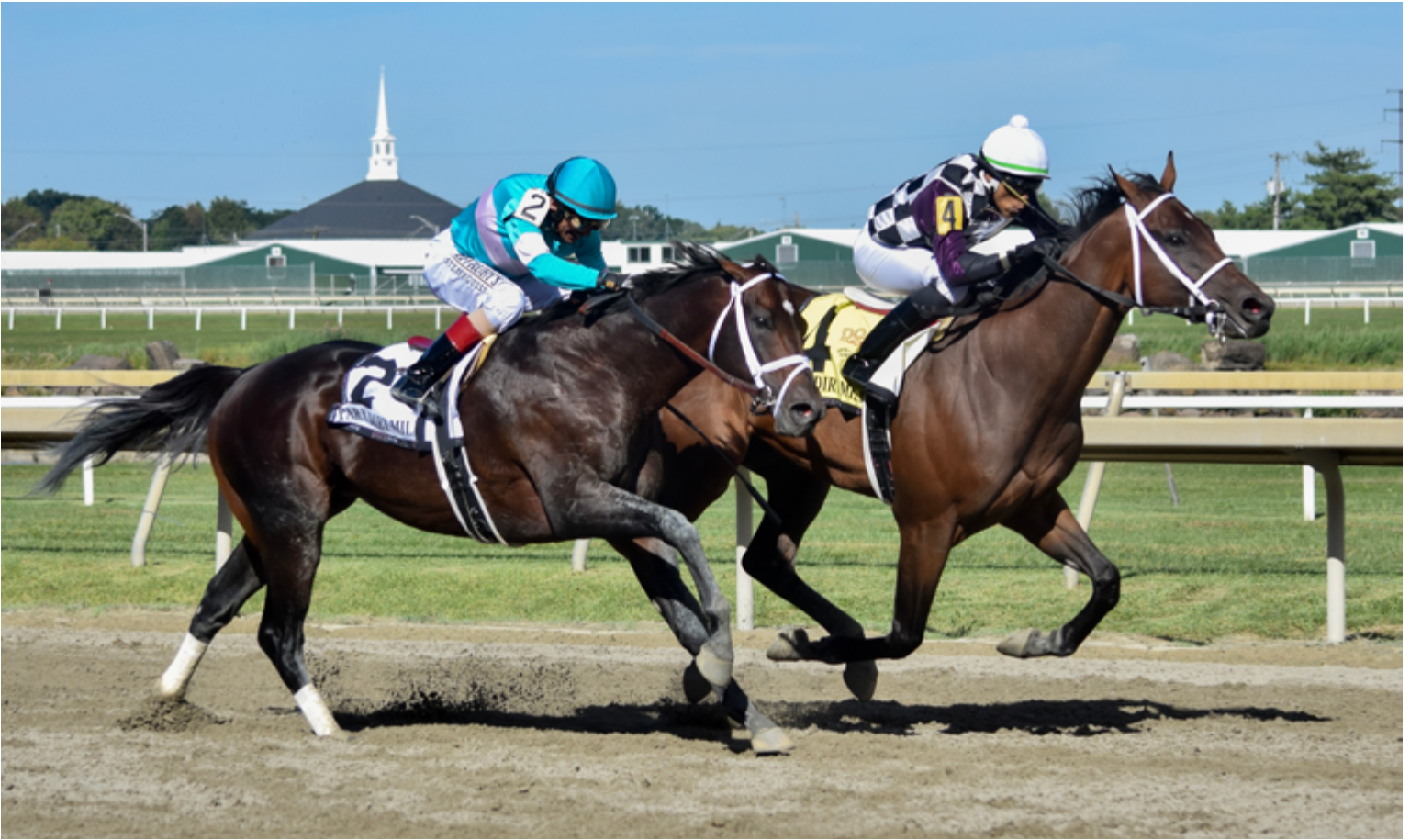
Far Mo Power

The sun shined right on Parx Racing for Pennsylvania Derby Day. Beautiful weather and a fantastic slate of top-quality horses brought droves of fans out to the Bensalem oval on Sept. 24. A record 10 stakes races made up the 13-race card, including four Pennsylvania-bred stakes.