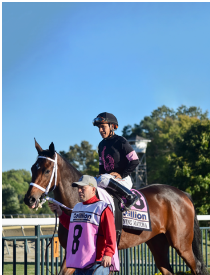
Morning Matcha

The $200,000 Plum Pretty brought together top fillies and mares going two turns on the dirt. Even following the scratch of fan favorite Chub Wagon, it still promised to be an exciting