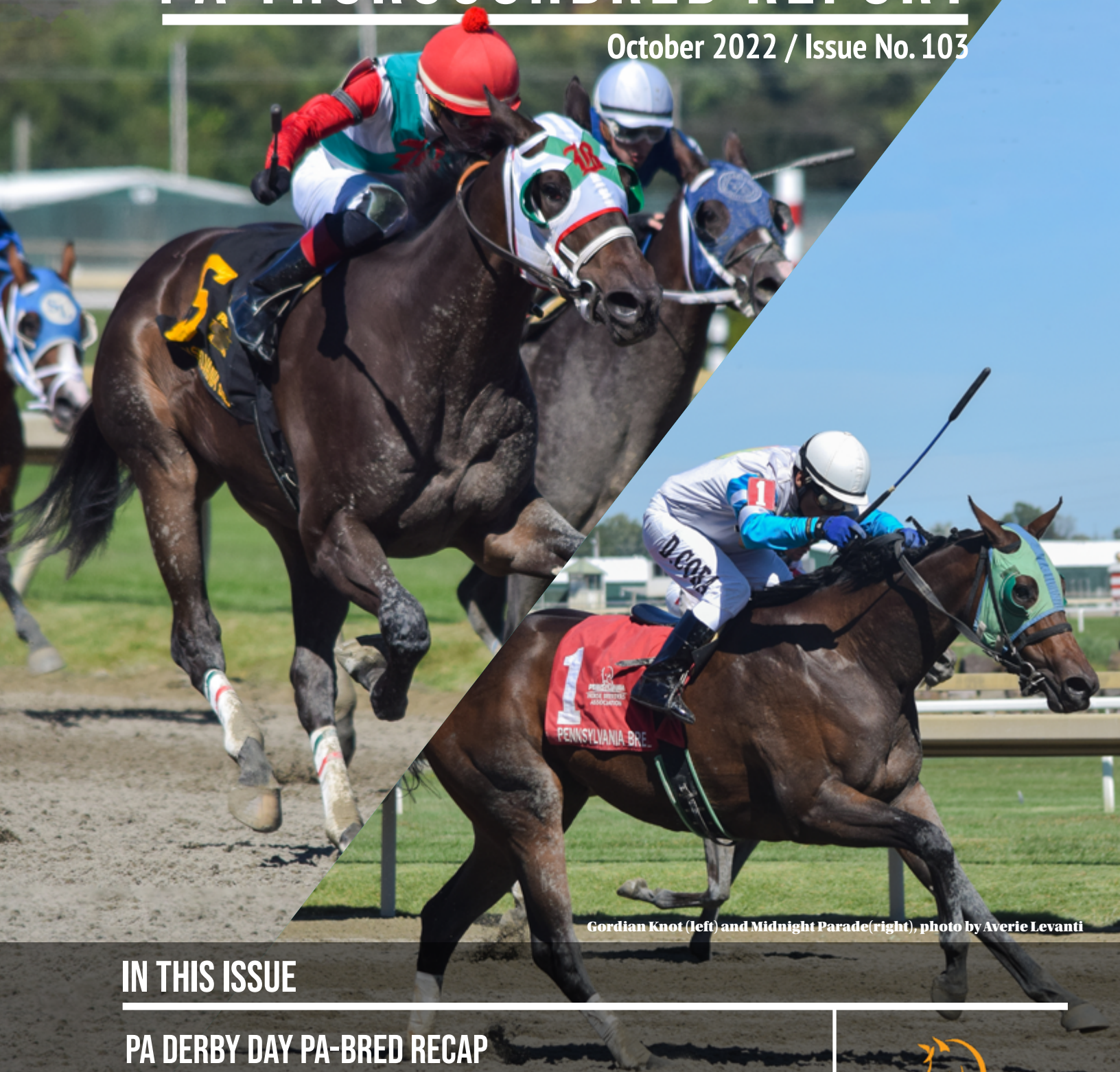
Gordian Knot (left) and Midnight Parade(right)