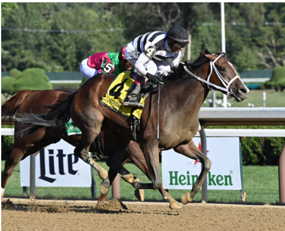
Leader Of The Band

Catsuit, now 22, has given Schwartz 10 foals. Eight