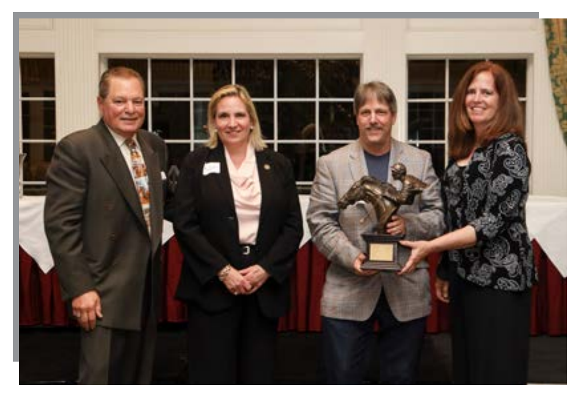
Horse of the Year, Older Female & Female Sprinter

The champions & leading breeders were celebrated May 13 at The Inn at Mendenhall