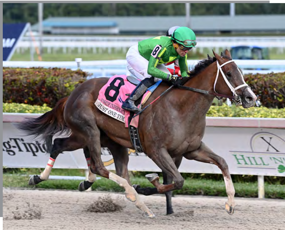
JUST ONE TIME IN THE G2 INSIDE INFORMATION S AT GULFSTREAM PARK