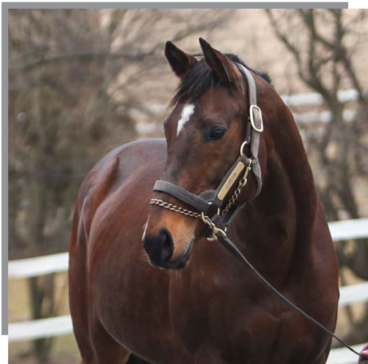
LENTENOR