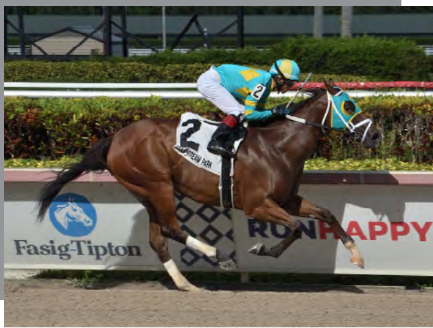
Jakarta in the Powder Break S

f, 3, Declaration of War–Newstouse, by Unbridled's Song. ($135,000 '20 FTMYRL). O-Wonder Stables, Madaket Stables LLC and Golconda Stable, B-Equivine Farm (PA), $9,600.