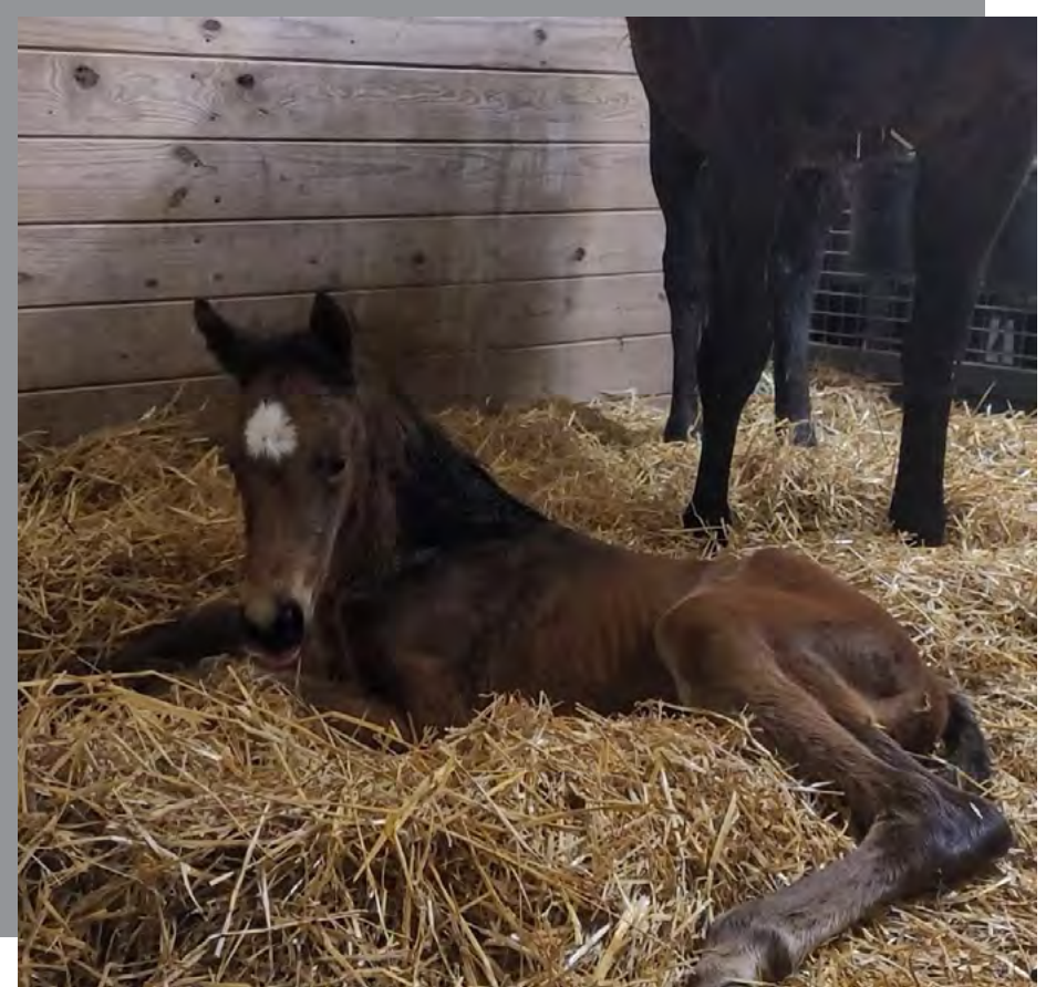
Katarica Disco & 2020 colt

Another durable campaigner out of Katarica Disco is Smooth B, who was born in 2015. In 39 starts he has earned $528,288, winning the Danzig Stakes at Penn National and