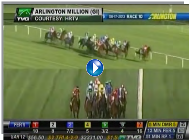
REAL SOLUTION 2013 ARLINGTON MILLION

Real Solution was initially retired to stand alongside his sire at Ramsey Farm in 2015. The Ramseys began to consolidate their stock the following year, and Real Solution was moved to Calumet Farm. After a two-year lease at Blue Star Racing in Louisiana, Real Solution returned to Calumet Farm in 2020 and is standing for a 2022 stud fee of $5,000. His top progeny to date include two-time Canadian stakes winner Sister Peacock, stakes winners Ramsey Solution and Catch a Bid, and the stakes-placed Speedy Solution and Queens Embrace. ■