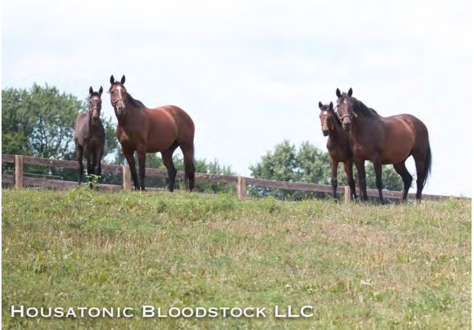
Three generations: Katarica Disco (R) with 2021 Weigelia colt; Mischief Music (R), Katarica Disco's daughter, with her 2021 colt by Blofeld

Few broodmares can boast that all 10 of their starters have won, but Katarica Disco is in a class of her own. Perhaps they should make a movie about her success? ■