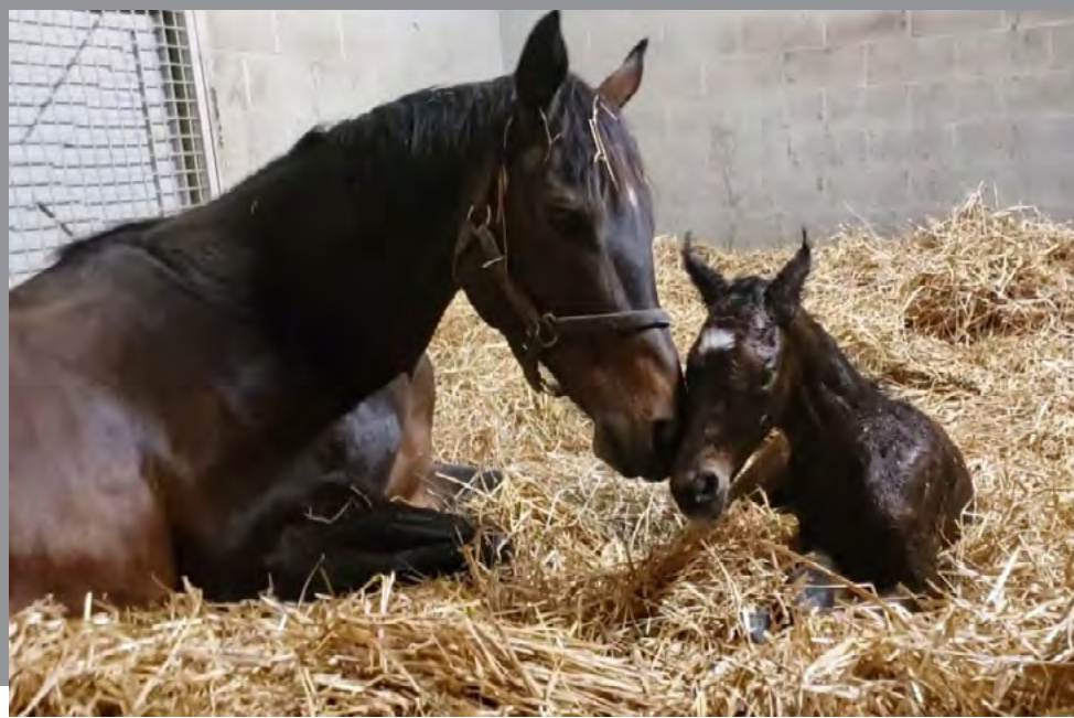
Katarica Disco & 2019 filly