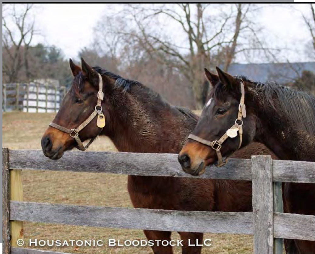
Silmaril & Katarica Disco