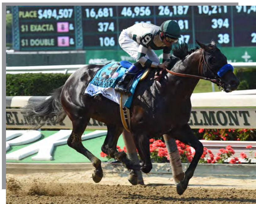
MOR SPIRIT 2017 MET MILE, BELMONT PARK

From three years on the racetrack, Mor Spirit started fourteen times with six wins and five seconds for earnings of $1,668,400. He recorded five total stakes wins, four of which were graded, and placed in four others. He was a two-time Grade 1 winner with scores in the Los Alamitos Futurity and Metropolitan Handicap. Mor Spirit finished first or second in eleven of fourteen starts, with his only off-the-board efforts coming in the Kentucky Derby and off of lengthy layoffs. ■