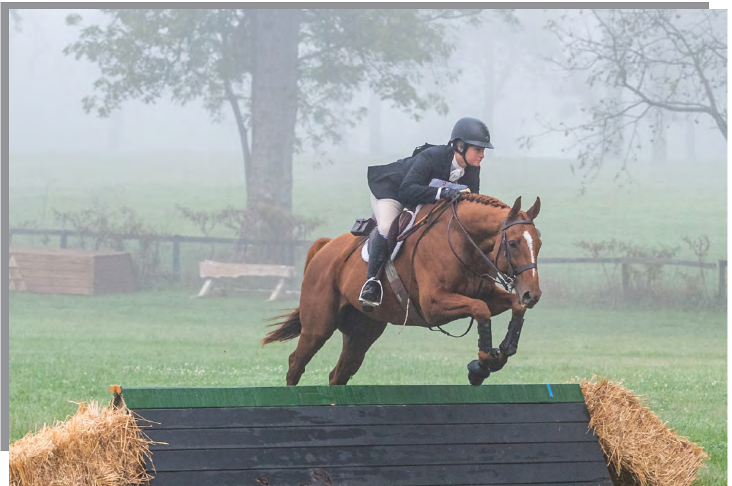
Page McKenney jumps through the fog