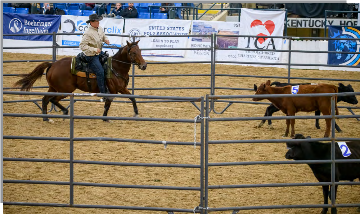
Poised for Action sorts some cows

Barwin, Monba Number Five and Poised for Action all split the $2,500 prize for leading Pennsylvania-bred thanks to their runner-up efforts in their respective disciplines.