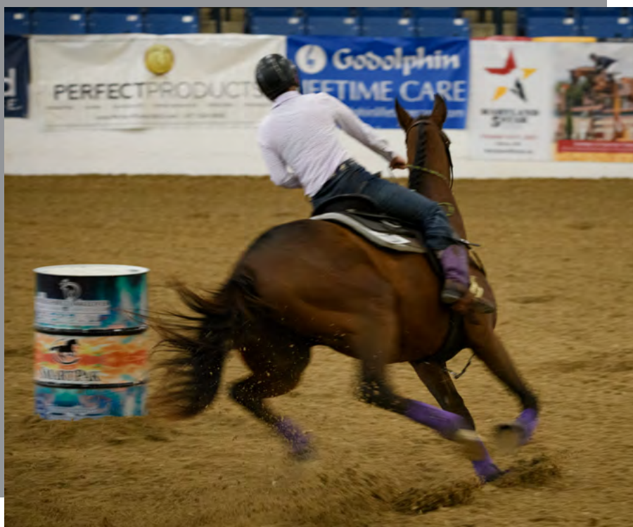
Gumdrop's Chiclet running barrels, ultimately moving to the finale in Eventing