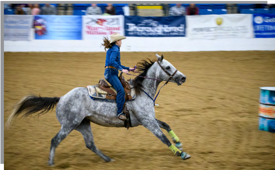
Monba Number Five turns and burns in the Barrel Racing Finale

score during the finale, she ultimately finished second overall. Since the Makeover, Monba Number Five has headed to Georgia and competed around barrels again.