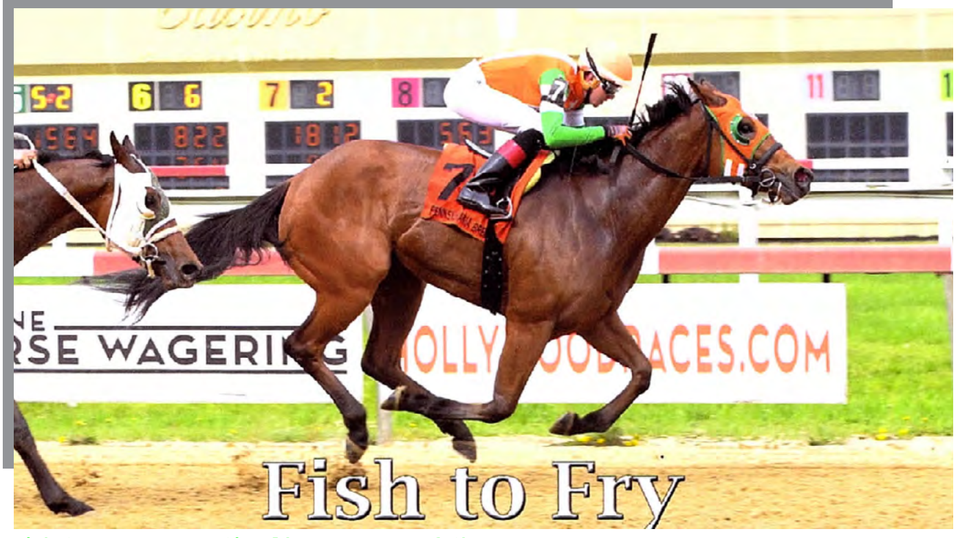
Fish to Fry - Penn National's 2019 Horse of the Year

But it wasn't until his next win that Well Spelled cemented himself as a major contender. Following an allowance loss at Monmouth when third against older runners, Well Spelled was 14-1 in the $300,000 Gallant Bob Stakes at Parx on Sept. 22, 2012. He would face a