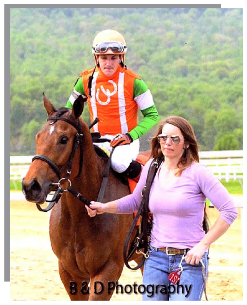
Fish to Fry - Penn National's 2019 Horse of the Year

lit up the racetrack, but she ultimately produced first Well Spelled, and then Grade 2-winning millionaire Kobe's Back in 2011. That popular colt was a stakes winner at 2, 3, 4, and 5!