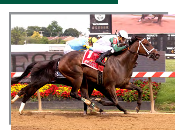
SHINE AGAIN S PIM, $95,000, 3YO&UP, 6F, 6-13.