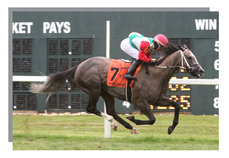
SAND SPRINGS S. GULFSTREAM PARK, $100,000, 4YO/UP, F/M, 1 1/16MT, 3/27.