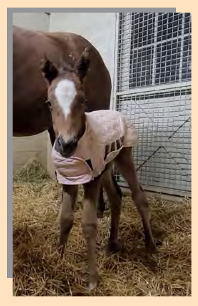
Pink Princess X Weigelia filly bred by WynOaks Farm