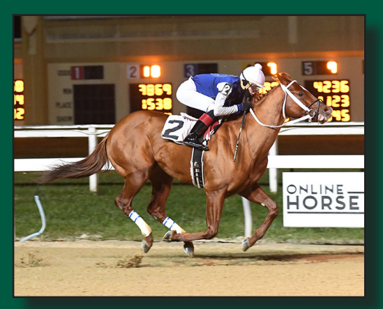
Male Sprinter MIDTOWNCHARLYBROWN

Six starts, all stakes. Three wins at three different tracks. Bronx Beauty flew home in the Penn Ladies Dash at Penn National in 1:08.57 for 6 furlongs; battled home to win the Dashing Beauty at Delaware Park; and proved tough when taking Monmouth Park's Regret. She was also third in the Roamin Rachel at Parx.