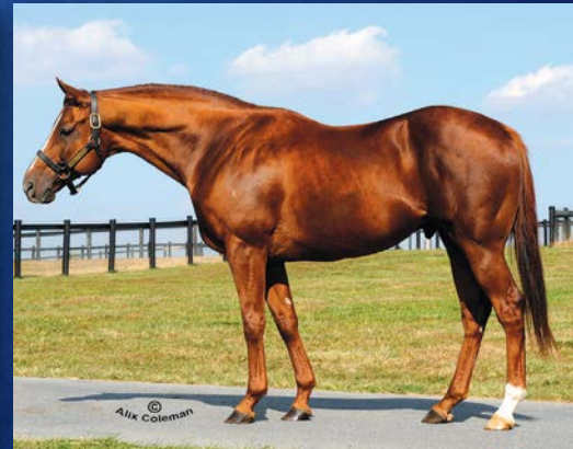
LIMEHOUSE – LA ILUMINADA 2020 FEE: $5,000 FOR PA FOALING MARES $7,500 OUTSIDE MARES