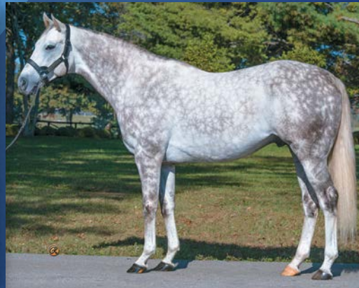
TAPIT – RHUMB LINE 2020 FEE: $3,500 LFSN