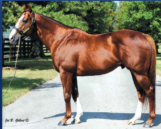
CATIENUS – MRS. K. 2020 FEE: $2,500 LFSN