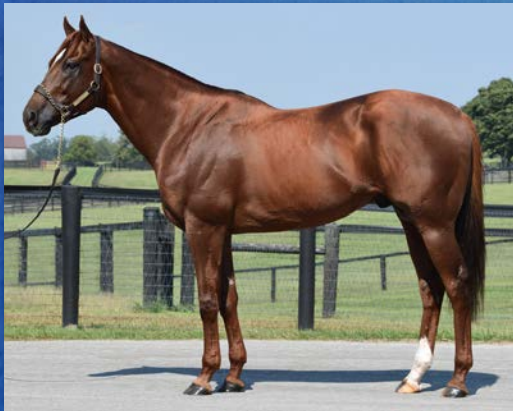
SPEIGHTSTOWN – FIFTH AVENUE BALL 2020 FEE: $2,500 LFSN