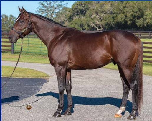
PIONEEROF THE NILE – SAINT BERNADETTE 2020 FEE: $5,000 LFSN