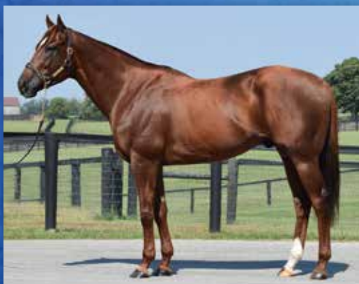
SPEIGHTSTOWN – FIFTH AVENUE BALL 2020 FEE: $2,500 LFSN