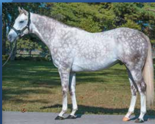
TAPIT – RHUMB LINE 2020 FEE: $3,500 LFSN