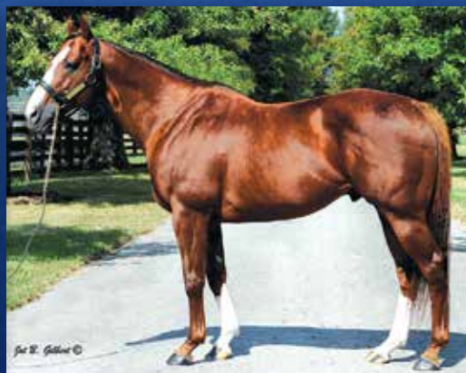
CATIENUS – MRS. K. 2020 FEE: $2,500 LFSN