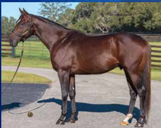
PIONEEROF THE NILE – SAINT BERNADETTE 2020 FEE: $5,000 LFSN