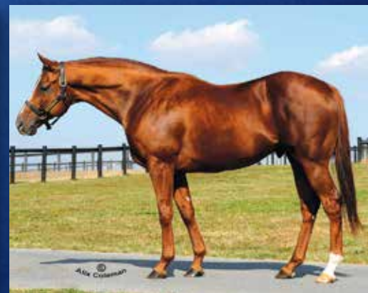
LIMEHOUSE – LA ILUMINADA 2020 FEE: $5,000 FOR PA FOALING MARES $7,500 OUTSIDE MARES