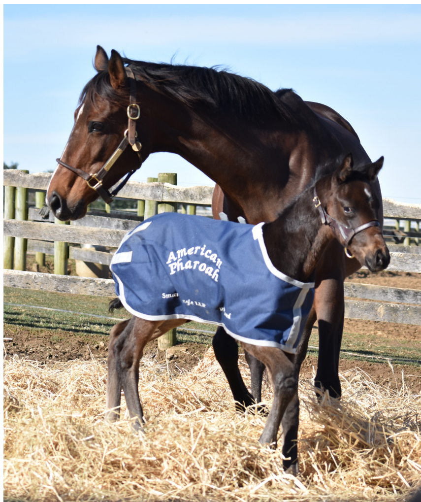
Cover & inside back cover images: Triple Crown Winner American Pharoah's PA Bred colt represents royalty for the Commonwealth's Racing Industry.