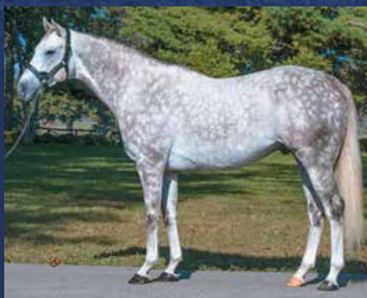
TAPIT – RHUMB LINE 2019 FEE: $3,500 LFSN