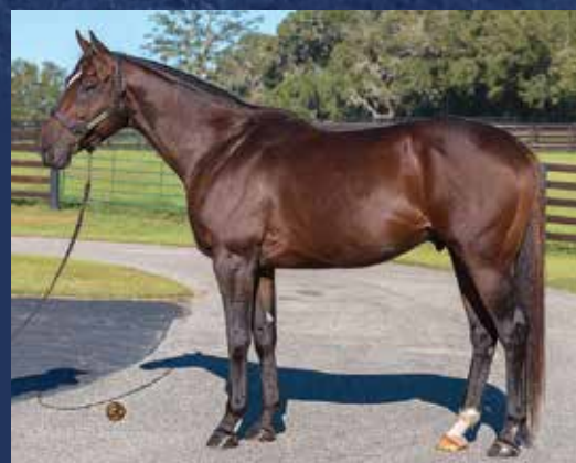
PIONEEROF THE NILE – SAINT BERNADETTE 2019 FEE: $5,000 LFSN $4,000 FOR PA FOALING MARES DISCOUNTS ON MULTIPLE MARES