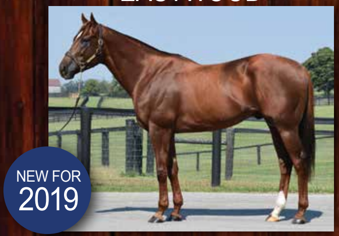
SPEIGHTSTOWN – FIFTH AVENUE BALL 2019 FEE: $2,500 LF