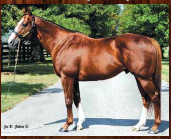
CATIENUS – MRS. K. 2019 FEE: $2,500 LF