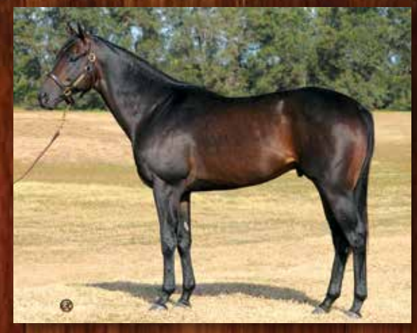
DISTORTED HUMOR – THERESA'S TIZZY 2019 FEE: $2,000 LF