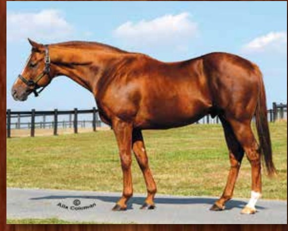
LIMEHOUSE – LA ILUMINADA 2019 FEE: $4,500 LF