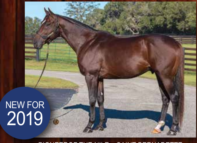
PIONEEROF THE NILE – SAINT BERNADETTE 2019 FEE: $5,000 LF