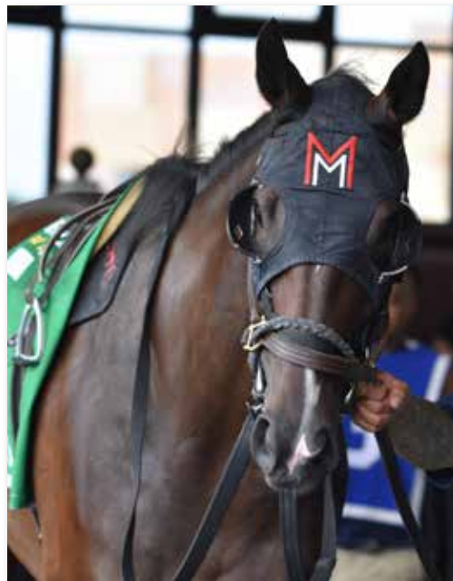
Zipper's Hero, bred by Castle Rock Farm, winner of the Dr. Teresa M. Garofalo Memorial Stakes.