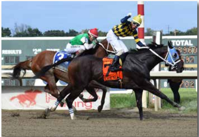
The Man, bred by Glenn E. Brok LLC, winner of the Banjo Picker Sprint Stakes.