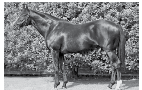
Jump Start was the leading PA sire in 2017.

progeny generated $207,984. Other stallions who stand or stood at the farm were Fairbanks ($54,989), Medallist ($28,836), Love of Money ($21,298), El Padrino ($7,352), and Bullsbay ($366). Jump Start was the top sire in the Mid-Atlantic region in 2017, with total progeny earnings of more than $6.2 million. His top Pennsylvania-bred during the year was Late Breaking News,