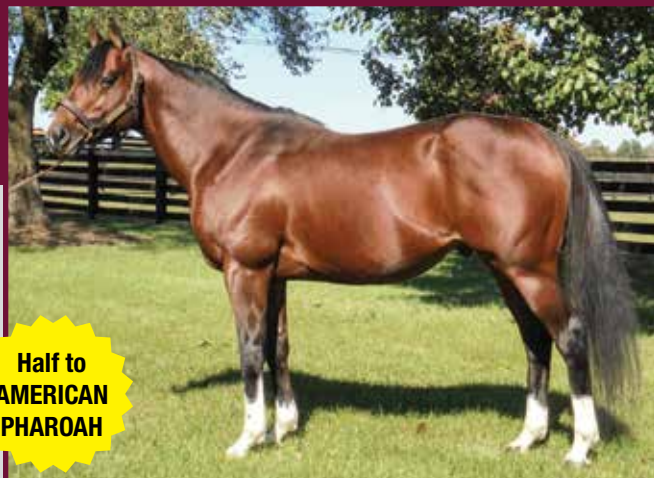
Half to AMERICAN PHAROAH

XIXIXI Maimonides–Littleprincessemma, Yankee Gentleman Half-brother to Triple Crown winner AMERICAN PHAROAH . Son of Maimonides, G1 Hopeful S-placed by champion VIN- DICATION and half-brother to leading sires ROMAN RULER and EL CORREDOR . $3,500 LFSN/$2,500 PA foaling mares