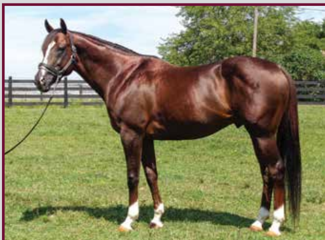
VICTORY ISLE Spartan Victory–Misty Isle, by Digamist Carr de Naskra-line stallion. A beautifully conformed horse and a “10” mover. Proven jump pedigree. Ideal for show and sport horse breeding programs. $1,500 LFSN; AWR