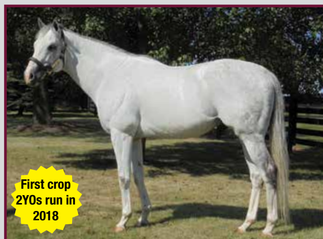
First crop 2Y0s run in 2018

DRINKWITHTHEDEVIL Smart Strike–Approve, Deputy Minister Proven sire of 10 stakes horses, incl. BISQUE ($174,829), SOOKIE'S KOOKIES , etc. By the sire of champions CURLIN , ENGLISH CHANNEL , LOOKIN AT LUCKY —all proven sires. Solid family of CROWNED . $1,000 LFSN; BC nom.