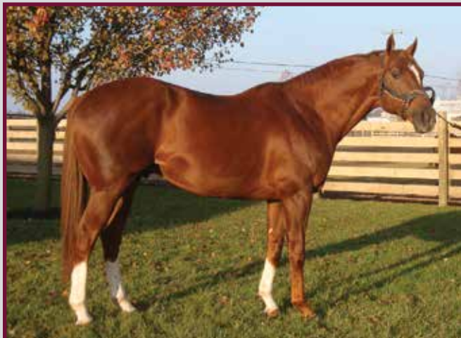
SOUTHERN SUCCESS Dixieland Band–My Success, A.P. Indy Stakes winner from the immediate family of G1 millionaires AFFIRMED SUCCESS and EXBOURNE . Sire of R FROSTY ONE ($271,869), Golden Success ($277,856), Southern Kisses ($135,988) and 23 additional winners. $1,500 LFSN