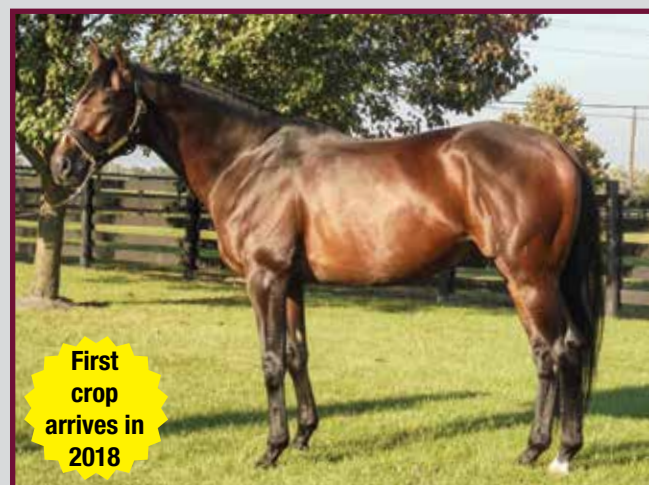
RED VINE Candy Ride (Arg)–Murky Water, By Storm Cat BC nom. Stakes winner of $775,715. Placed in 5 graded stakes including Breeders’ Cup Dirt Mile, Cigar Mile, Pacific Classic. Defeated BAYERN , HOPPERTUNITY , HONOR CODE , PRIVATE ZONE , TAPITURE , WICKED STRONG , etc. $3,500 LFSN

By the sire of BC Classic winner GUN RUNNER