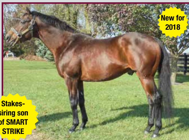
New for 2018

XIXIXI Maimonides–Littleprincessemma, Yankee Gentleman Half-brother to Triple Crown winner AMERICAN PHAROAH . Son of Maimonides, G1 Hopeful S-placed by champion VIN- DICATION and half-brother to leading sires ROMAN RULER and EL CORREDOR . $3,500 LFSN/$2,500 PA foaling mares