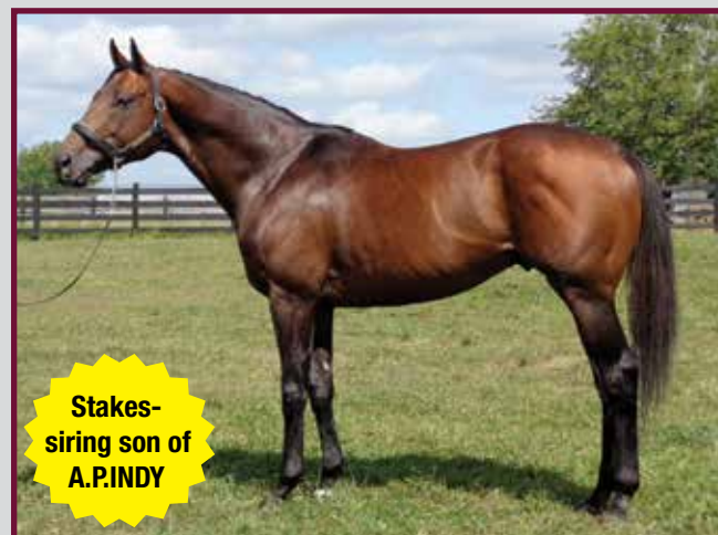
TAKEN BY THE STORM Stormy Atlantic–Paint Brush, Broad Brush Allowance-winning son of champion-siring STORMY ATLANTIC , sire of sires GET STORMY , LEONNATUS ANTEAS , etc. Fourth dam is foundation mare LASSIE DEAR , granddam of the incomparable A.P. INDY . $1,500