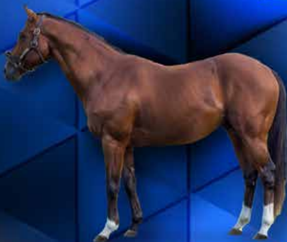
ECLIPTICALSPRALINE ECLIPTICAL – MS. MOSTLY