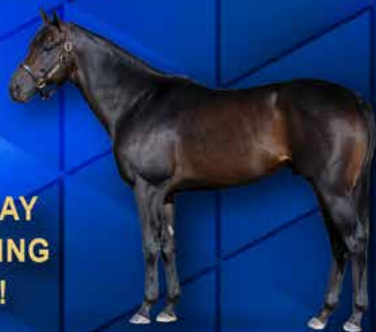
GOT THE LAST LAUGH DISTORTED HUMOR – THERESA'S TIZZY