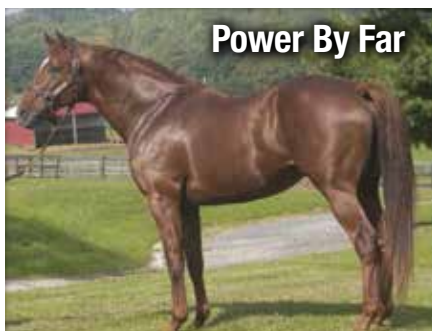
Power By Far

From only 114 foals of racing age, Power by Far has sired multiple graded stakes-placed and multiple stakes winner Power of Snunner ($562,310), as well as multiple stakes winner Power by Leigh