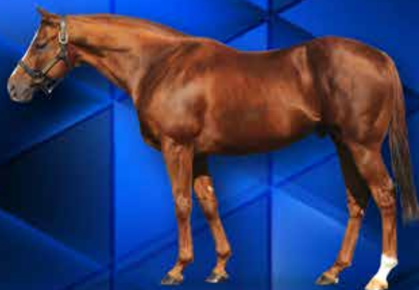
UPTOWNCHARLYBROWN LIMEHOUSE – LA ILUMINADA

CALL US TODAY ABOUT BREEDING INCENTIVES!