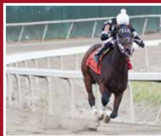
Alan's Legacy wins by 22 1/2 lengths