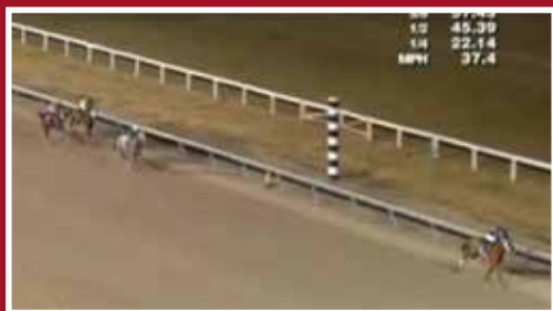
Midtowncharlybrown wins maiden special by 11 1/2 lengths