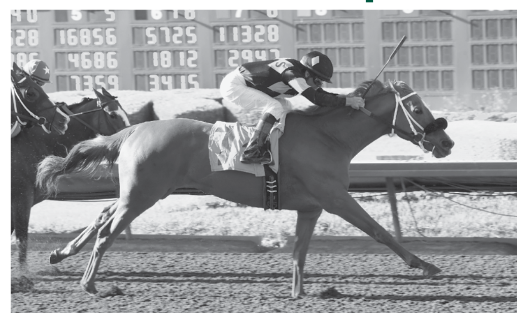
Finest City: 2016 Breeders' Cup winner, Eclipse Award winner and PA-Bred Horse of the Year.