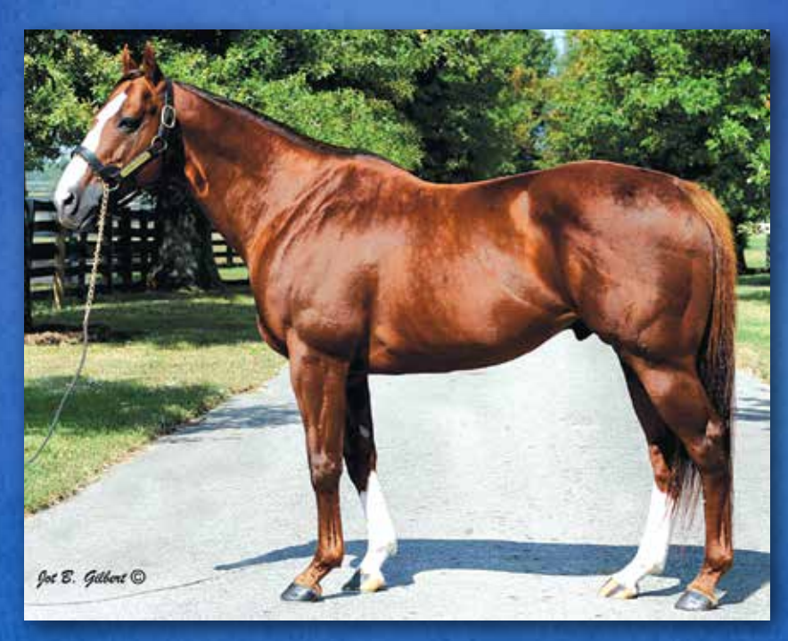
CATIENUS-MRS. K., BY DIXIELAND BAND 2017 FEE: $2,500 LIVE FOAL

Sire of 2016 Danzig Stakes Winner ROLIN WITH OLIN ($136,424)