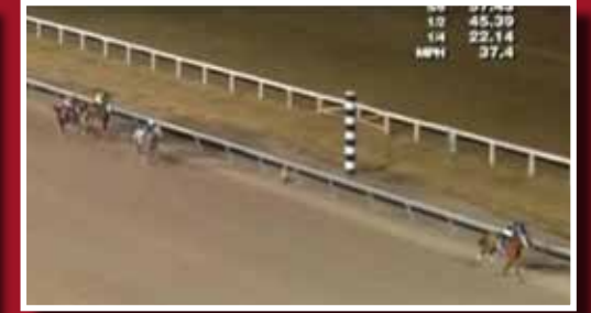
Midtowncharlybrown wins maiden special by 11 ½ lengths