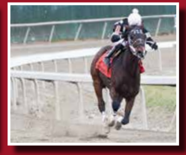
Alan's Legacy wins by 22½ lengths