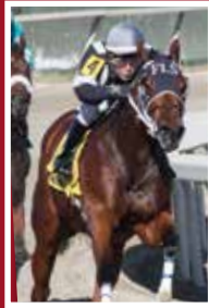
True Sweetheart romps by 10 lengths

FIRST CROP: 5 STARTERS—3 DIFFERENT WINNERS! ALL BY DOUBLE-DIGIT MARGINS: