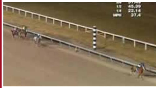
Midtowncharlybrown wins maiden special by 11 ½ lengths