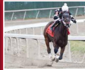
Alan's Legacy wins by 22½ lengths