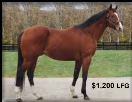
ECLIPTICALSPRALINE ECLIPTICAL – MS. MOSTLY