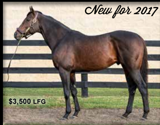
PEACE AND JUSTICE WAR FRONT – STRIKE THE SKY

Sunday, January 22nd from 12:00pm to 3:00pm