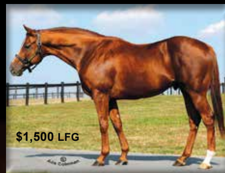
UPTOWNCHARLYBROWN LIMEHOUSE – LA ILUMINADA