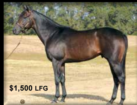
GOT THE LAST LAUGH DISTORTED HUMOR – THERESA'S TIZZY