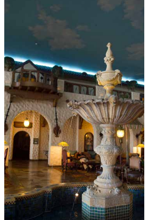
The Hotel Hershey's opulent Fountain Lobby served as the perfect backdrop for cocktail hour.