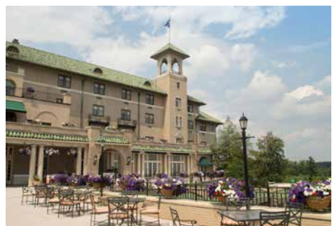
Back at the "Sweetest Place on Earth"! The 2016 Iroquois Awards Banquet was once again held at The Hotel Hershey on June 24.