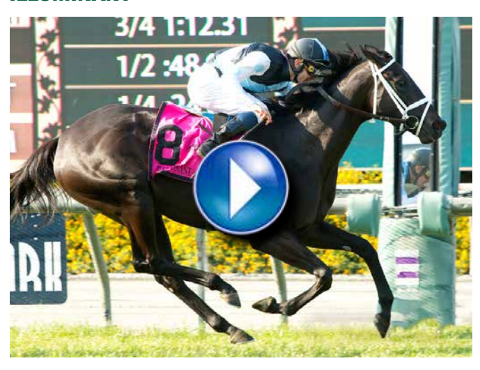
f, 4, Quality Road - Sparkling Number Won - GAMELY S-G1, Santa Anita, $300,000, 1 1/8MT, 3YO/UP, F/M, 5/30.