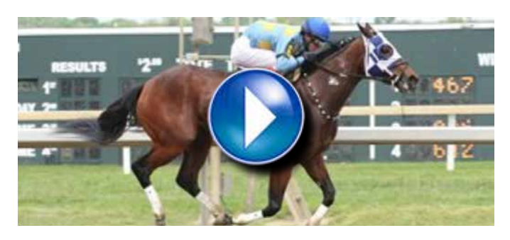
m, 5, Jump Start - Disco Flirt Won - FOXY J G S, PARX Racing, $100,000, 7F, 3YO/UP, F/M, 6/4.