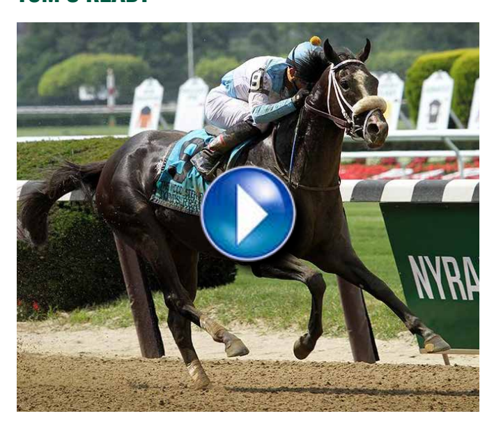
c, 3, More Than Ready - Goodbye Stranger Won - WOODY STEPHENS S-G2, Belmont Park, $500,000, 7F, 3YO, 6-11.