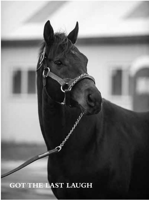
GOT THE LAST LAUGH