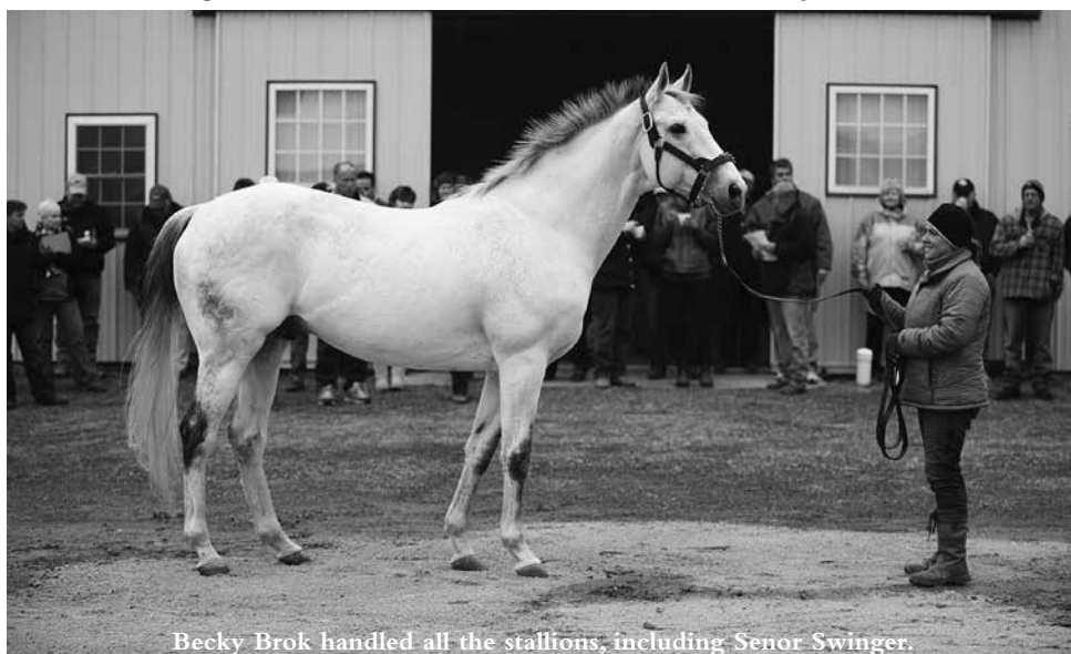
Becky Brok handled all the stallions, including Senor Swinger.