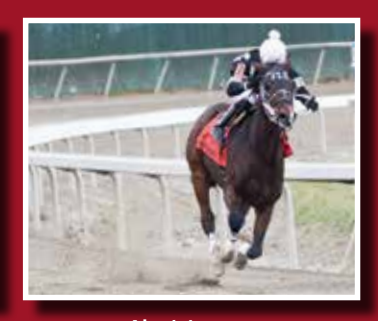
Alan's Legacy wins by 221/2 lengths