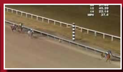
Midtowncharlybrown wins maiden special by 11 ½ lengths