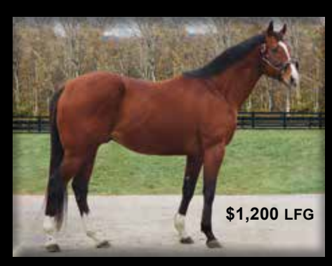
ECLIPTICAL SPRALINE ECLIPTICAL - MS. MOSTLY