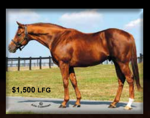
UPTOWNCHARLYBROWN LIMEHOUSE - LA ILUMINADA