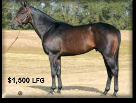
GOT THE LAST LAUGH DISTORTED HUMOR - THERESA'S TIZZY