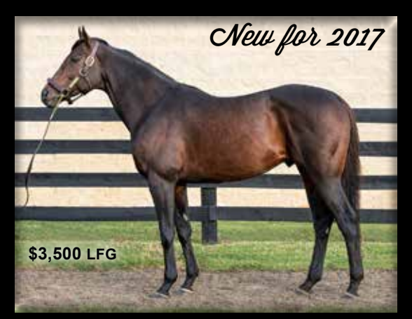
PEACE AND JUSTICE WAR FRONT – STRIKE THE SKY

Sunday, January 22nd from 12:00pm to 3:00pm