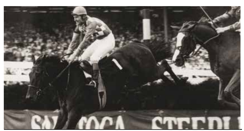
Blasts From the Past takes a look back at PA-Breds of distinction throughout history. The majority of the biographies were included in the PHBA's 50th year anniversary commemorative booklet, published in 1998.