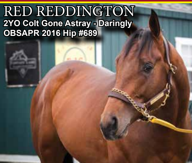
RED REDDINGTON 2YO Colt Gone Astray -Daringly OBSAPR 2016 Hip #689

For as little as $750 you can become part owner in a promising 2YO colt and enjoy all the privileges of ownership which include visiting the barn and talking to jockeys & trainers.