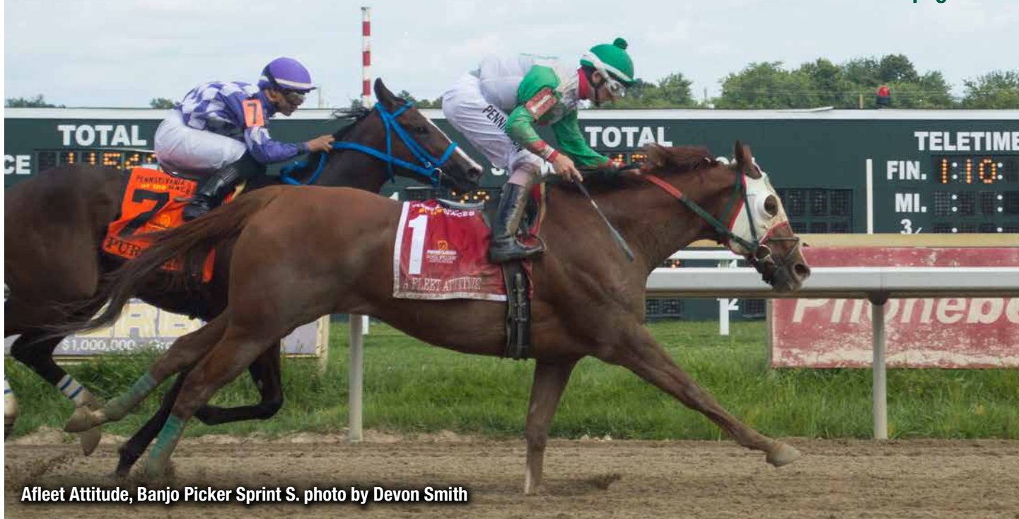
Afleet Attitude, Banjo Picker Sprint S.