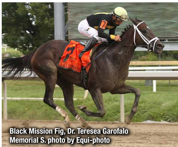
Black Mission Fig, Dr. Teresa Garofalo Memorial S.

The last stakes winner of the day was, appropriately, Winning the Medal in the $100,000 Marshall Jenney Handicap, in a blanket finish despite starting the 5-furlong sprint breaking from an outside post. The Medallist gelding is living up to his pedigree, with the Jenney being his first stakes win—bringing his lifetime earnings up to $195,725. Breeder