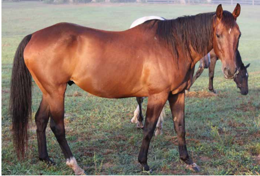
Banjo Picker, photo courtesy of Barbara Luna

The majority of horse races in the country are for claimers, but that doesn't stop every horseman from fantasizing that their next claim will become a champion. While not every horse will transform from a $50,000 claim to a $5.2 million-earner—like 2015 National Museum of Racing & Hall of Fame inductee Lava Man—every once in awhile a dream will come true.