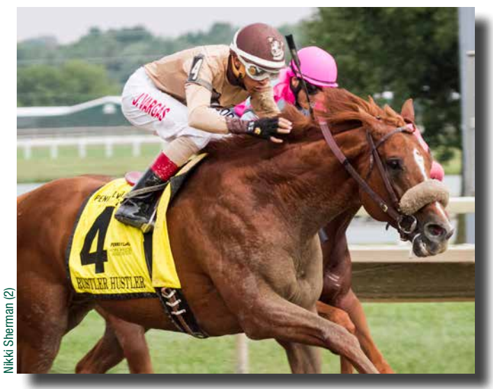
RUSTLER HUSTLER "Rustler Hustler was a great horse with a cool personality. I

More than one-third of the horses assisted by Turning for Home and New Start are PA-Breds – 534 and 125, respectively – especially since owners traditionally keep their PA-Breds in the state to compete for the enhanced purses. PA-Breds in Turning for Home earned nearly $30 million for their racing connections