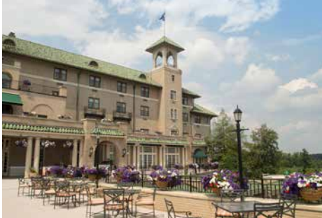
Back at the "Sweetest Place on Earth"! The 2016 Iroquois Awards Banquet was once again held at The Hotel Hershey on June 24.