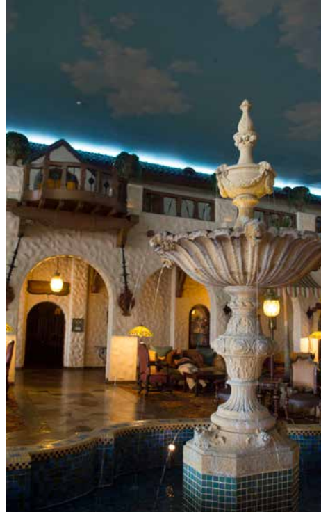
The Hotel Hershey's opulent Fountain Lobby served as the perfect backdrop for cocktail hour.