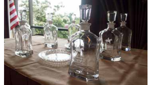
This year, over 44 PA-Breds earned an Iroquois Award for their stakes win. Breeders took home beautifully engraved decanters to serve as their award.